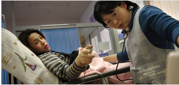
A midwife in Tono in northern Japan conducts an examination. In communities like this, urban obstetricians receive data by remote on their cell phones to advise women when they should go to an urban hospital to give birth.

Pediatric units are likewise endangered. According to the Ministry of Health surveys, 3,938 hospitals had pediatric units in 1994, but this number had fallen to 3,231 by 2004. At the same time, the system for providing nighttime emergency pediatric care has weakened.