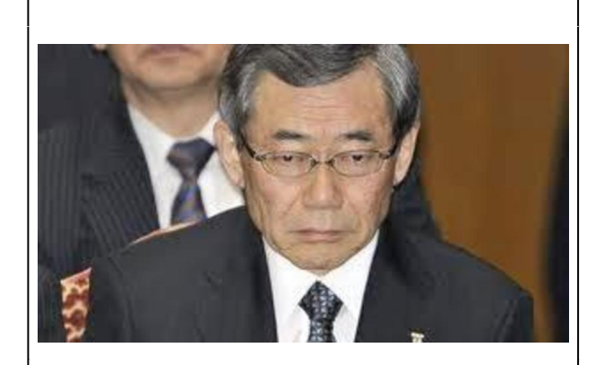
Shimizu Masataka, former TEPCO president

METI official and that this is inappropriate. In the 2012 Diet session he was grilled about the specific case of an ex-METI official who drafted the 2010 national energy plan to build fourteen new reactors who landed a top advisory position at TEPCO in January 2011. (Japan Press Weekly 4/14/11) Following this public exposure the official in question resigned and Edano stated that METI officials should refrain from landing jobs in utility companies. It remains to be seen, however, whether amakudari can really be curbed. (Japan Times, 4/19/11) When Shimizu Masataka, the disgraced president of Tepco, retired he parachuted into an outside director's position at Fuji Oil in which TEPCO is a significant shareholder. Fuji Oil defended its brazen personnel decision by saying Shimizu had invaluable experience and expertise, provoking sardonic media commentary since he went AWOL and was useless in managing the Fukushima crisis.