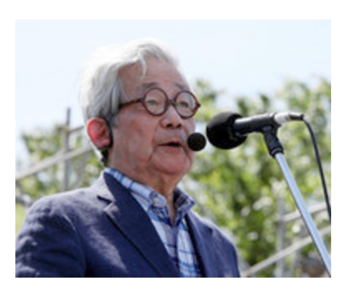
Anti-Nuclear Rally attended by over 100,000 at Yoyogi Park July 22, 2012. Oe Kenzaburo Addresses the Crowd.

Given widespread nuclear anxieties among the Japanese people, and public opinion polls in 2012 showing over 70% favored phasing out or significantly reducing nuclear energy, the nuclear village went into damage control mode. Keidanren and other large business organizations lobbied vigorously to block efforts to downsize nuclear power, citing growing trade deficits due to energy imports and increased business flight overseas because of Japan's high and rising costs of electricity. Pro-nuclear advocates also raised the issue of global warming, pointing out that in the absence of nuclear power Japan could not meet its CO2 emission reduction pledges. In addition, renewable energy was portrayed as unreliable and too costly.