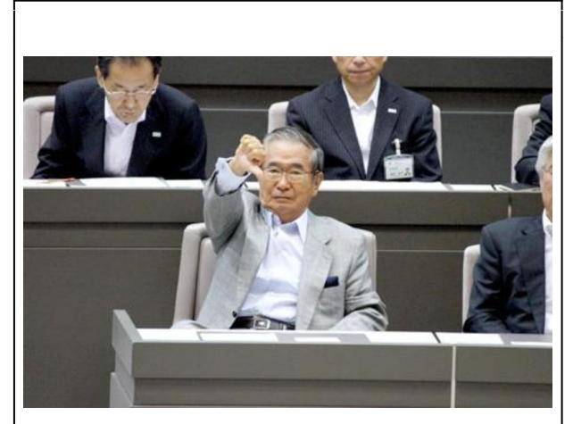
Tokyo Governor Ishihara Shintaro Rejects Petition signed by 320,000 Tokyoites to Hold Referendum on Nuclear Power in June 2012.

Times 8/5/2012) Combined with the tightly scripted format of the meetings, media reports convey the impression that yet again the government was trying to marginalize public opinion and orchestrate the outcome.