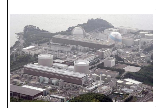
Genkai Plant's 4 Reactors are Close Together

to explain why Japan's reactors are built in clusters. While this makes sense in terms of maximizing revenues, there are obvious risks associated with multi-reactor complexes because if something goes wrong at one reactor there is greater potential for cascading consequences while managing an emergency at multiple reactors is inherently more difficult. (Perrow 2011)