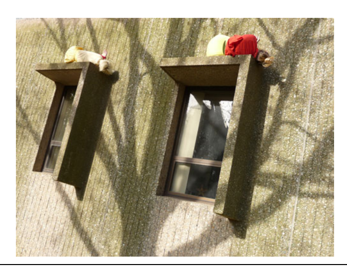
Photo 3. PearsonWidrig DanceTheater, A Curious Invasion, 2011, Connecticut College, CT. Dancers: Connecticut College students.

was performed on a stone ledge with two levels at Wave Hill but has also appeared on leather couches (using the two levels of the backrest and seat cushions) at the Hopkins Centre for the Arts at Dartmouth College in Hanover, New Hampshire.