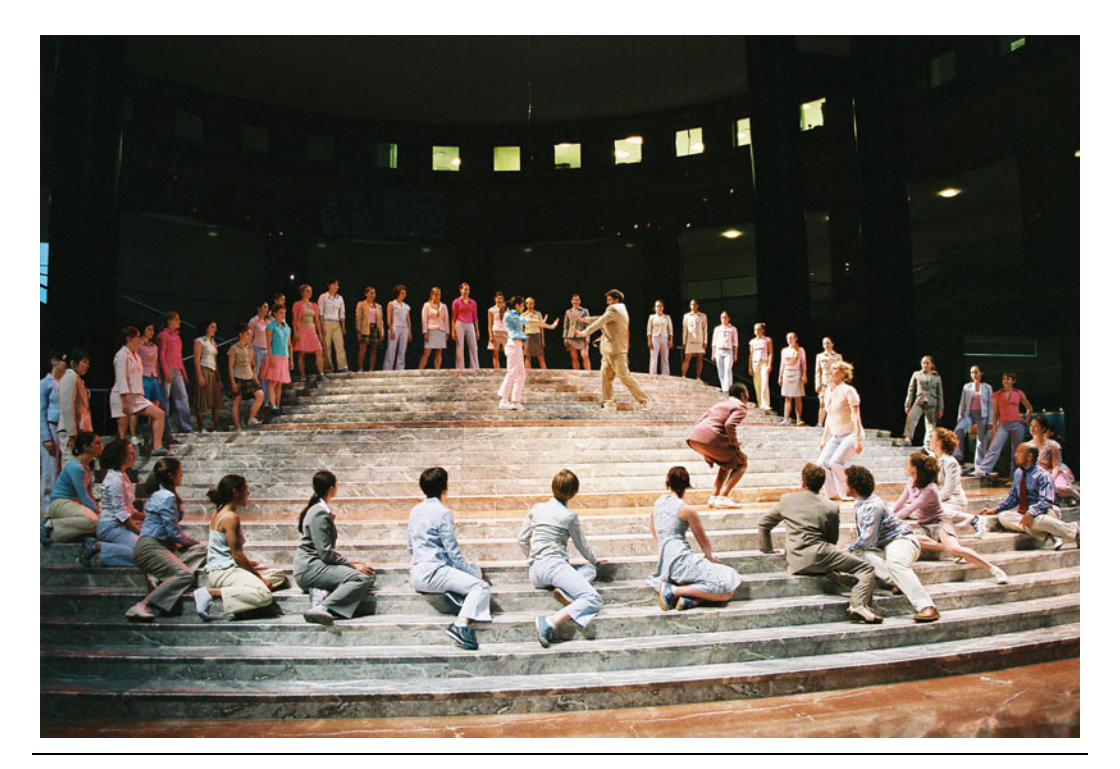
Photo 5. Stephan Koplowitz, Grand Step Project: Flight, 2004, Winter Garden, Manhattan, NY.