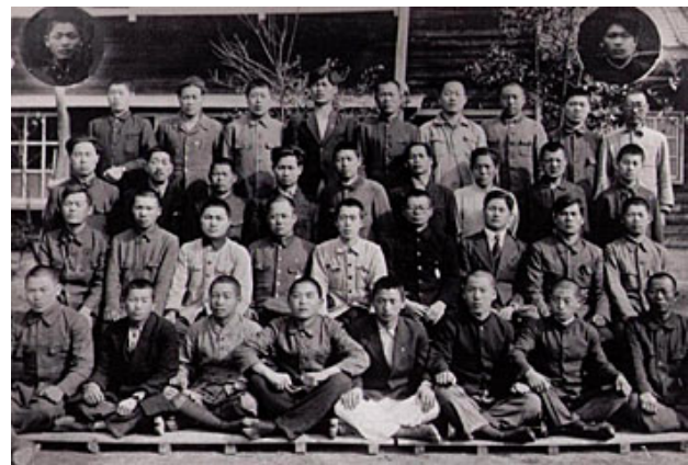
Korean forced labourers of Aso Mining Co. in front of their dorm at the Atago Mines

2008, Japan's Aso Taro and Korea's Lee Myung-bak adopted a similar stance, agreeing to bury historical problems in order to concentrate on the economy. When we recall that the company run by Aso's family during World War II had used Korean forced labour at its mines and that Aso had previously infuriated Koreans by defending wartime atrocities, Lee's setting aside of history can be interpreted as a sort of priority to economic benefit over justice and national dignity.