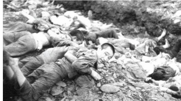
In July 1950, one month after the start of the Korean War, approximately 1,800 inmates of Daejon Prison were taken to nearby Golryeonggol and shot dead by the police and MPs

Starting from the late 1970s, Korea's democratization movements significantly shook the Cold-War system. Korean activists saw that the Soviet-U.S conditioned national division had legitimized not only dictatorships and human right abuses but had also blocked any possibility of liquidating the remnants of Japanese colonialism. Political democratization was accompanied by nationalist discourse and by the overcoming of Cold-War legacies. It proceeded simultaneously with the old agenda of cleansing the legacy of Japanese colonialism, and it also brought back the issue of national reunification and of 'recovering full national sovereignty'. This was because democratization in South Korea always tended to focus attention on the international politics that supported national division and on the U.S intervention in the Korean peninsula. The democratic transition in South Korea was also a chance to enhance Korean's historical consciousness. Examination of the role of pro-Japanese collaborators under Japanese colonial rule (1910-1945) and of incidents such as that at No Gun Ri (July 1950) where U.S forces killed several hundred refugees during the Korean War, became part of the political agenda.