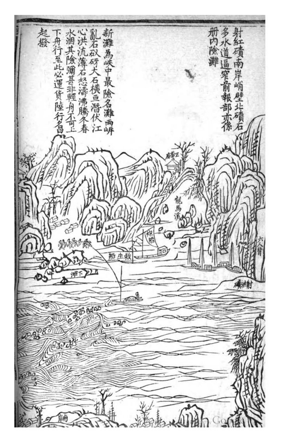
Figure 3. Illustration of the Xin Rapid, Xiajiang tukao , 1883 edition.

riverscape.<sup>29</sup> Parker's comment on the necessity of the meticulous study of rapids foreshadowed a wave of surveys aimed at codifying knowledge about rapids at the turn of the twentieth century. His