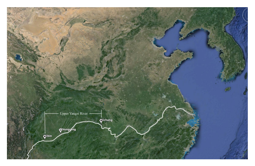
Figure 1. The Upper Yangzi River, topography: Google Earth (2015).

These comments from Munby vividly capture the central role of rapids (tan) in shaping the daily operation of steam navigation on the Upper Yangzi well into the 1940s, more than four decades after the introduction of steam shipping into this inland waterway. The Upper Yangzi rapids were fierce, unpredictable, and turbulent currents descending like small waterfalls. They impeded navigation, particularly steam navigation, because they not only imposed technological constraints on the mechanical designs of vessels but also required shipping crews to be highly sensitive and coordinated in tackling constant changes. Most of these rapids disappeared after the Three Gorges Dam project, but the knowledge about their distribution has been inscribed into the landscape and is still used to structure many daily experiences along the river, such as the allocation of navigation infrastructures and the organization of collective responsibility units.<sup>3</sup> This article traces a series of initiatives to survey, chart, theorize, and cope with those rapids that took place between the 1870s and the 1920s, as regular steam navigation was gradually being established on the Upper Yangzi River. In particular, this article highlights how the riverine environment, as well as the experiential knowledge of local boatmen, reshaped the knowledge, institutions, and infrastructures of various imperial powers during the global expansion of steam technologies at the turn of the twentieth century.