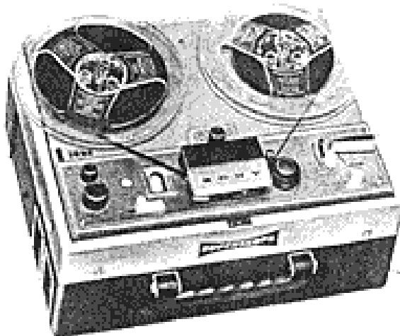
Sony Superscope Tape Recorder, 1957

Japan and Korea do not any longer combine “low incomes and low wages with significant innovative potential” – the third of the “distinct” challenges that China and India are said to pose. But that was arguably the case fifty years ago when Japan had a per-capita GNP that is smaller than China’s today at a time when the likes of Sony were seizing on the commercial potential for the transistor. One can accept that “China and India are associated with very different forms of regional integration” – the fourth so-called “distinct challenge.” But the picture the authors present of China’s integration – “the processing of imported raw materials and intermediates” -- has long also characterized Japan’s and Korea’s economic ties with the rest of the region.