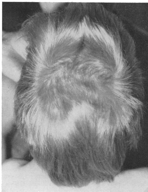
Fig. 2. Hair vortices of V.M.

The child can see and hear, says "Mama" and "Papa", but no other words. Development is estimated to be retarded by about 1\frac{1}{4} years. EQ~0.5.