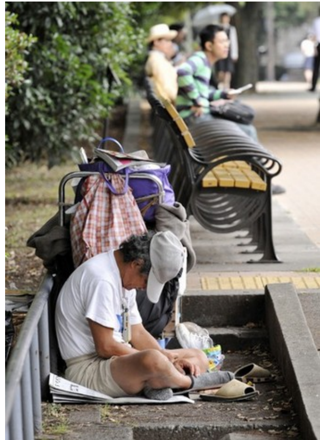
An unemployed man rests in a Tokyo Park, July 29, 2008

The economic outlook in Japan is very grim, as these brief overviews (links below) indicate. Right now, Japan has the worst growth outlook in Asia. That is a surprising fact, if one recalls that this is a country presumably dusting itself off from the collapse of its own bubble nearly two decades ago. After such a long period of economic crisis, Japan should be renovated and ready to thrive. But instead, it may be in worse shape than even the US (though clearly not Iceland and much of Eastern Europe). Japanese financial institutions were not big players in the CDOs, CDSs and the other toxic assets that have ravaged the capital bases of banks in the US and much of Europe. Rather, Japan's key policy failure would appear to be over-reliance on exports as the engine of growth, while hoping that the fruits of this growth would trickle down into the rest of the economy and bolster demand. But in the rest of the economy, deregulation of labour and other markets had seen firms shifting to insecure employment (especially part-time and contractual staff) and rolling back pay, thus crimping the level of demand. And that weak domestic demand was of course blunting domestic-oriented businesses' incentives to invest (cf. export-oriented businesses' incentives to invest). With the startling 35% drop in exports in December 2008, it's as if someone kicked the chair away from a man who was standing on one to test out what it felt like to have a noose around his neck.