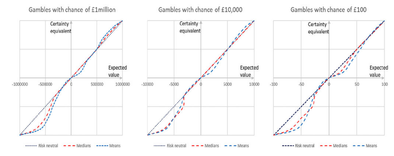
Figure 3. Diagrammatic Consistency with the Reflection Effect over Money Outcomes.