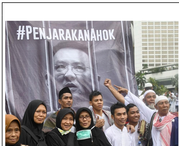
Muslims protest against Jakarta Governor Basuki "Ahok" Tjahj Purnama, who is Chinese Christian in December 2016

one person died in these protests, compared to the thousand killed in the riots preceding Suharto's ouster in 1998. But it was alarming to see hundreds of thousands of Muslims shouting anti-Christian and anti-Chinese slogans, and to see him not only defeated, but convicted on a trumped-up blasphemy charge. (The judges ignored the much more lenient recommendation of Ahok's prosecutors and capitulated to inflamed public opinion.)