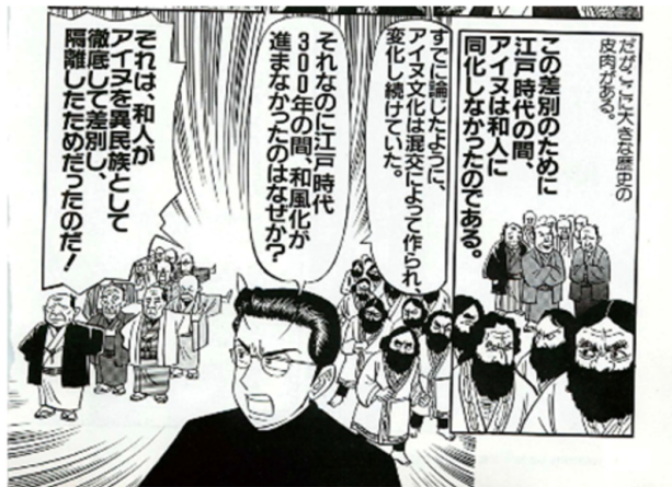
Figure 7: "Ainu culture" developed in a hybrid fashion alongside "Wajin culture." So, why was it that after 300 years of the Edo period "Ainu" had not "Japanified"?