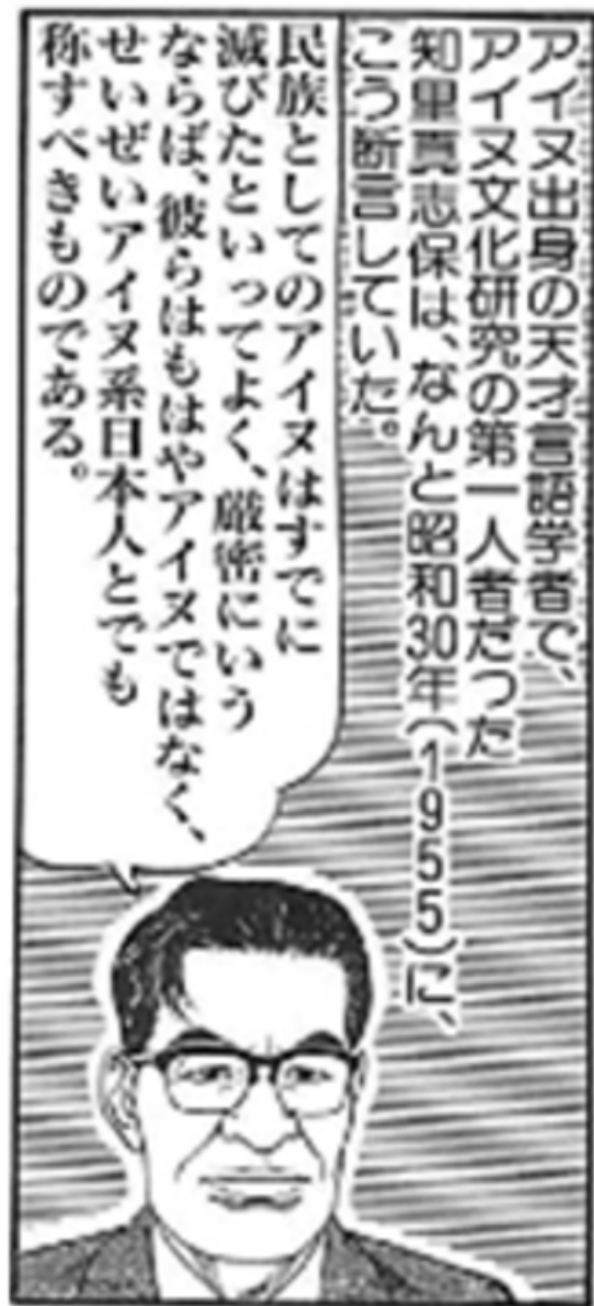
Figure 8: Chiri, the “genius linguist of Ainu origin” and the scholar at “the forefront of Ainu culture studies” claimed in 1955 that Ainu “as a people/ethnos ( minzoku ) can be...” (Source: Kobayashi Yoshinori, “Honke Gōmanism Sengen Dai-rokuwa: Ainu ‘Minzoku no Decchi-age’ wo Yurusuna!” [Original Haughtiness

We can say that in all sectors of life the ‘lifestyle of the Kotan (Ainu settlement)’ has completely died out. There are hardly any people who can disseminate and pass on the old language or tales and stories. Among men over fifty years old this is particularly the case, let alone both men and women under forty. Even those few elder women who have survived, today they are completely Japanified ( nihon-ka ) and among them there are women in their seventies who use abacus to calculate, keep account books, and others who have modernized to the extent that they are called by modern nicknames. There is even one woman who can read and write English. There are also women who read the newspaper every day without fail and debate about the vote for women. Surely this is a degree of assimilation that naichijin [those living in Japan proper as opposed to the “colonies”] couldn’t even begin to imagine. 26