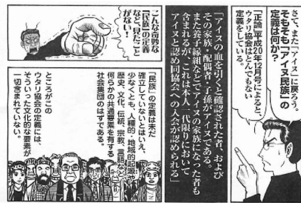
Figure 1: One example of Kobayashi's contradictions of logic. Here Kobayashi's alter-ego wonders what the definition of the "Ainu People" ( Ainu minzoku ) is and quotes a version of the criteria for membership of the Ainu Association of Hokkaidō; criteria which had family connections (including adopted offspring) at center. He asserts that while the definition (?) of a minzoku (people/ethnos) is yet to be established, the Ainu Association fails to focus on the kind of "cultural elements" that seem to be widely agreed upon as minzoku criteria (Source: Kobayashi Yoshinori, "Gekiron-ban Gōmanism Sengen: Okinawa to Ainu, 'Dōka' wo dō kangaeru ka?," Nishimura Kōsuke ed., Gekiron Mook: Okinawa to Ainu no Shinjitsu , Tokyo: ōkura Shuppan, 2009, p. 19).