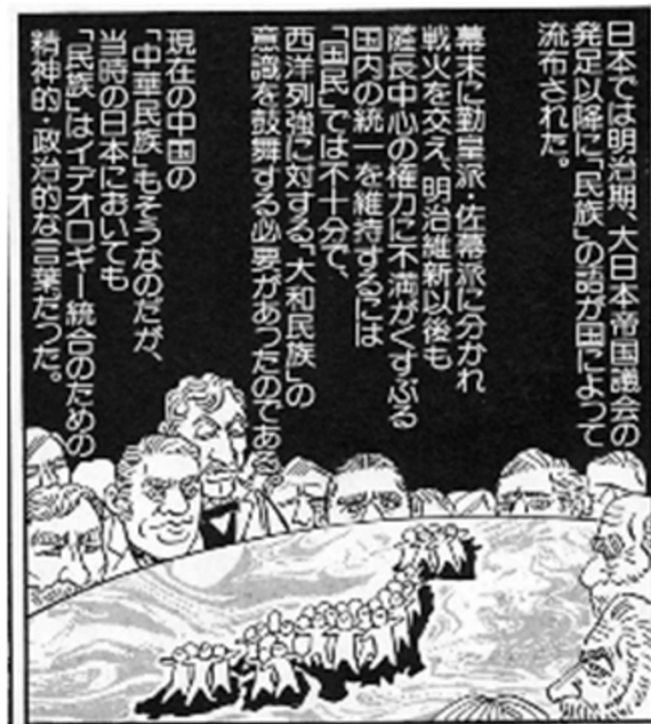
Figure 5: And yet, in explaining the existence of the “Yamato people” ( Yamato minzoku ), he claims, just like with the notion of “the Chinese” ( chūka minzoku ) today, the “Yamato people” was an important “psychological and political word used for ideological cohesion” against the threat of Western powers and to counter internal strife after the Meiji Restoration. Empiricism and political pros and cons aside, is it so hard to imagine that the “Ainu people” ( Ainu minzoku ) enjoys a similar ideological purpose with regard to, say Indigenous rights? (Source: Kobayashi Yoshinori, “Gōmanism Sengen extra: Nihon Kokumin toshite no Ainu ,” in Kobayashi Yoshinori ed., Washi-sm: Nihon Kokumin toshite no Ainu , Tokyo: Shōgakkan, 2008, p. 19).

toshite no Ainu,” in Kobayashi Yoshinori ed., Washi-sm: Nihon Kokumin toshite no Ainu , Tokyo: Shōgakkan, 2008, p. 44).