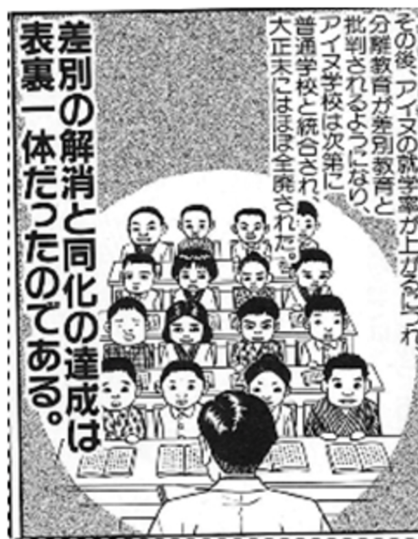
Figure 6: The assertion that “the solution to discrimination and the achievement of assimilation were two sides of the same coin” occurs in the context of post-Meiji Ainu education. The elimination of discrimination meant the elimination of separate Ainu schools set up under the 1899 Protection Act. Dōka , or “assimilation,” thus becomes an elegant circle – a response to previous attempts to

The central tenant of Kobayashi’s stance regarding “the Ainu” is more or less condensed in the following phrase from his manga: “the solution to discrimination and the achievement of assimilation were two sides of the same coin.” 19 From the point of view of Ainu policy, there is actually very little wrong historically about this statement. Achieving assimilation was indeed seen by Japanese policymakers as the best way to solve the problem of continued discrimination toward “the Ainu.” The problem for Kobayashi, is that he either cannot, or refuses, to see just why this was the case.