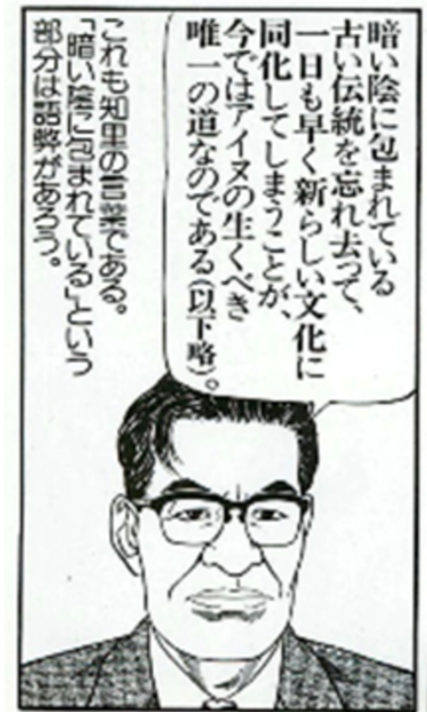
Figure 9: Chiri, in the afterword to Ainu Mintanshū , written in 1935, states, “the only path that the Ainu should try to live upon today is that in which they forget the old traditions wrapped in dark shadows and assimilate to a new culture as soon as possible.” The questions ignored here, however, are what Chiri meant by “assimilate” and “new culture.” That the break of modernity, and the problem of its critique and affirmation, provided the core motivation behind Chiri’s academic work is

Manifesto Part Six: Do not Forgive the ‘Fabrication of an Ethnic’ Ainu!], in Will , Tokyo: Waku Shuppan, April 2010, p. 198).