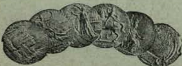
Gold Medal Allahabad 1910.

Paris 1900, Brussels 1910, Buenos Aires 1910.