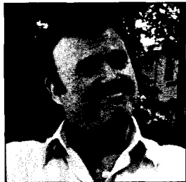
BERNARD BRAGG/CO-FOUNDER OF THE NATIONAL THEATRE OF THE DEAF.