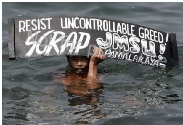
A Filipino fisherman holds a sign calling for scrapping the JMSU

The contents of the FEER article were quickly capitalized on by Arroyo’s opponents, some of whom accused the government of prejudicing the country’s territorial claims in the South China Sea and violating the 1987 Constitution, Article 12 of which stipulates that any consortium undertaking exploratory activities in Philippine waters must be 60 percent owned by Filipinos. Critics assailed the government for selling out the national patrimony; some even called for the president’s impeachment for treason. An even more explosive insinuation followed: that the Philippine leader had agreed to the JMSU as a quid quo pro for Chinese ODA (News Break, March 6). Opposition figures have, however, failed to provide any concrete evidence to back-up this extraordinary and incendiary claim.