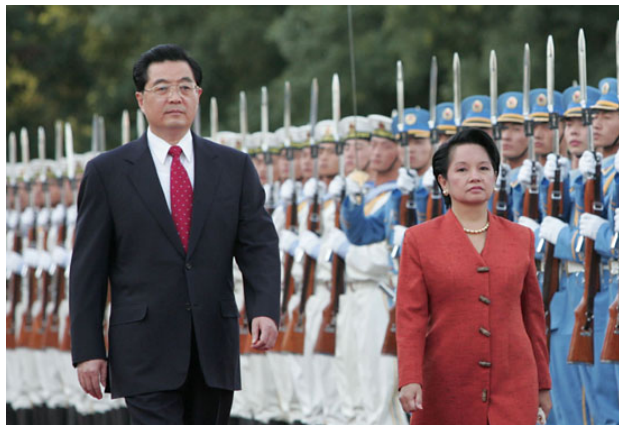
Hu and Arroyo

Three years later, a series of damaging scandals, investigations and controversies have stripped the gilt off this so-called golden age. Allegations concerning corrupt practices associated with the provision of Chinese overseas development aid (ODA) have prompted Congressional investigations, resulting in the cancellation of several major Chinese-backed initiatives, while Arroyo's opponents have called into question the constitutionality of the JMSU. Those seeking to oust President Arroyo have also made explosive allegations linking Chinese loans to the territorial disputes. Events in the Philippines over the past year not only represent a blow to the PRC's "charm offensive" in Southeast Asia, but also a major setback for Sino-Philippine relations, which many hoped had turned the corner.