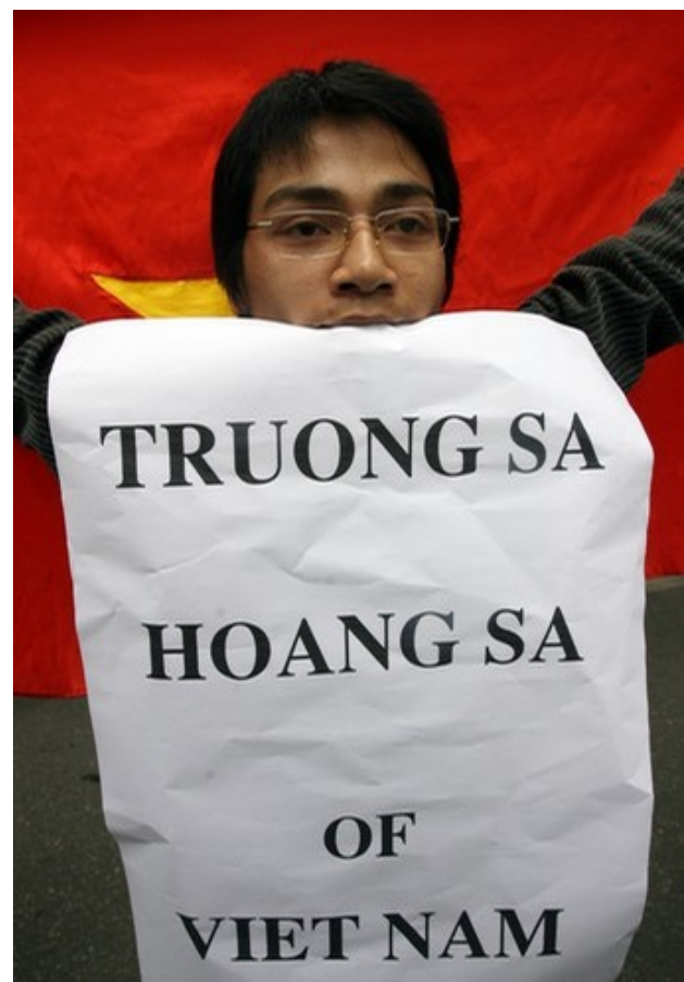
Protester in front of the Chinese embassy in Hanoi. "The Paracels and Spratlys of Vietnam"

allegation—not yet confirmed by the PRC government—that the National People's Congress had passed a law in early December 2007 creating a county-level city in Hainan province called Sansha to administer China's claims in the South China Sea, including the Paracel and Spratly Islands. For the Vietnamese government the Sansha proposal was the last straw. Over two consecutive weekends in December it allowed hundreds of students to conduct anti-China protests near the Chinese embassy in Hanoi and consular office in Ho Chi Minh City. The demonstrators expressed anger over China's claims in the Paracels and Spratlys, accusing Beijing of pursuing hegemonic ambitions (Straits Times, December 17, 2007).