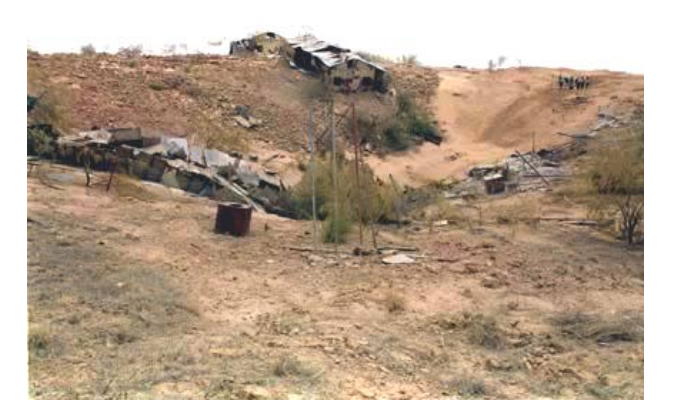
A view of the nuclear test site at Pokhran in Rajasthan