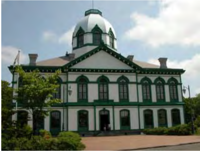
Hokkaidō colonial headquarters, Sapporo