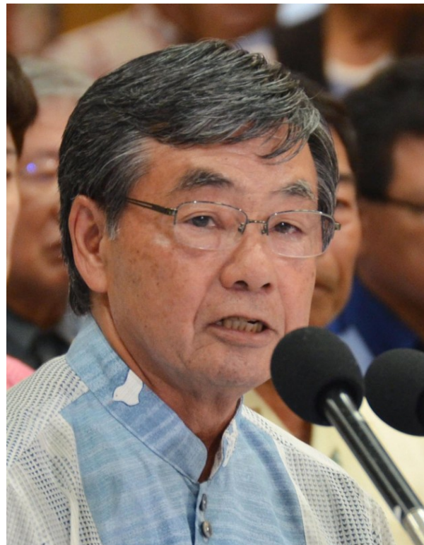
Former Mayor Inamine

build up momentum by winning re-election of Onaga Takeshi as prefectural governor in November, and then, with our colleagues at the Camp Schwab gate-front protest, we would press the government to abandon the construction of the Henoko base.