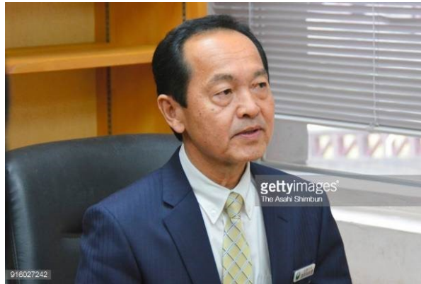
Mayor elect Toguchi Taketoyo

The election was remarkable in many respects. No national government had ever intervened so intensively to sway a local self-government outcome as had the Abe government for this election, dispatching top figures of government and ruling party to press the Toguchi cause and to promise generous rewards for cooperation. Following a plan attributed to Chief Cabinet Secretary Suga Yoshihide, Toguchi avoided any mention of the Henoko project, refused to debate his opponent, and stressed the economic benefits his close contacts with the national government would bring the city, emphasizing improved waste management and better child and aged care facilities. The candidate and his powerful sponsors in the national government made every effort to convey the impression that the election was a local matter, yet such efforts were belied by the importance and the national status of those sent from Tokyo to plead Toguchi's cause. In other words, fearful that the people would reject its design, both the candidate and the government concealed it. The election was fundamentally anti-democratic.