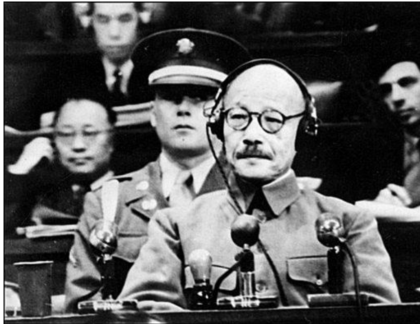
Tojo at the Tokyo Trial

In the postwar, with Japan at peace and occupied by US forces, the shrine has played a role in structuring how the war is remembered and presented to the Japanese people. It did so within a framework crafted by the occupation authorities who exonerated the emperor of all responsibility for initiating or waging war. Indeed, Hirohito was credited by both the occupation authorities and the Japanese government with bringing peace by personally intervening to end the war. Not only would the emperor not be deposed or tried as a war criminal, he would be shielded even from testifying at the Tokyo Trial. 14 The verdict at Tokyo, sentencing Tojo and a small number of prominent military and government officials to death, as well as the convictions of thousands of soldiers and police officials tried in B and C class tribunals, in leaving untouched Japan's supreme wartime leader, essentially absolved the Japanese people of the responsibility to examine their own behavior in the era of colonialism and war. For these reasons, the US as well as Japan ultimately shares responsibility for resolving issues of war responsibility that it helped to create, including those associated with the emperor and with Yasukuni Shrine.