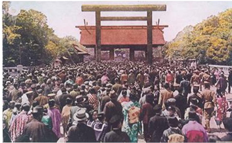
A festive crowd throngs the shrine in 1940

constituency, while implicitly legitimating the aims of colonialism and war for which so many Japanese soldiers and civilians died. 3