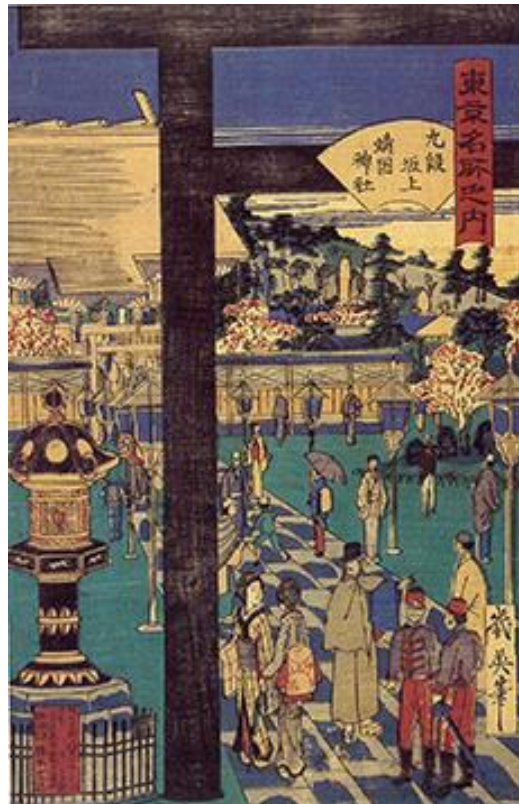
Yasukuni Shrine in a Meiji woodblock

Yasukuni Jinja both is and is not a “Japanese” problem. As a Shinto shrine with enduring historical links to the emperor—established in 1869 “to commemorate and honor the achievement of those who dedicated their precious life for their country”—and with a deep association with every Japanese war from the Meiji era through the Asia Pacific War, it evokes Japanese tradition linking Shinto, emperor and war. 1 Yet to see it simply as Japanese is to neglect a range of features characteristic of contemporary nationalisms. This view ignores important regional and global forces, particularly the role of the United States, in shaping politics and ideology from the Japanese occupation to today.