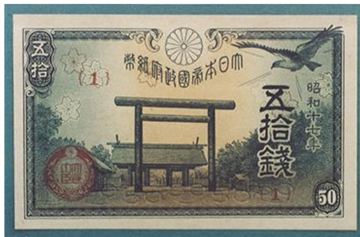
Shrine on 50 sen bill, 1943.

Another kind of alchemy goes hand in hand with the alchemy of exaltation. This is the alchemy of amnesia...forgetting atrocities and war crimes, forgetting the treatment of the military comfort women, of forced laborers, of those whose lands were invaded, homes destroyed and families slaughtered in the name of emperor and empire. While the military dead were enshrined as kami at Yasukuni shrine and their families received state pensions, the hundreds of thousands of civilian dead and many more injured were forgotten: neither shrine nor state commemorated their sacrifice or attended to the needs of their families. If nationalism has everything to do with invented tradition, as Benedict Anderson has compellingly argued, it is equally about suppressed or forgotten traditions.