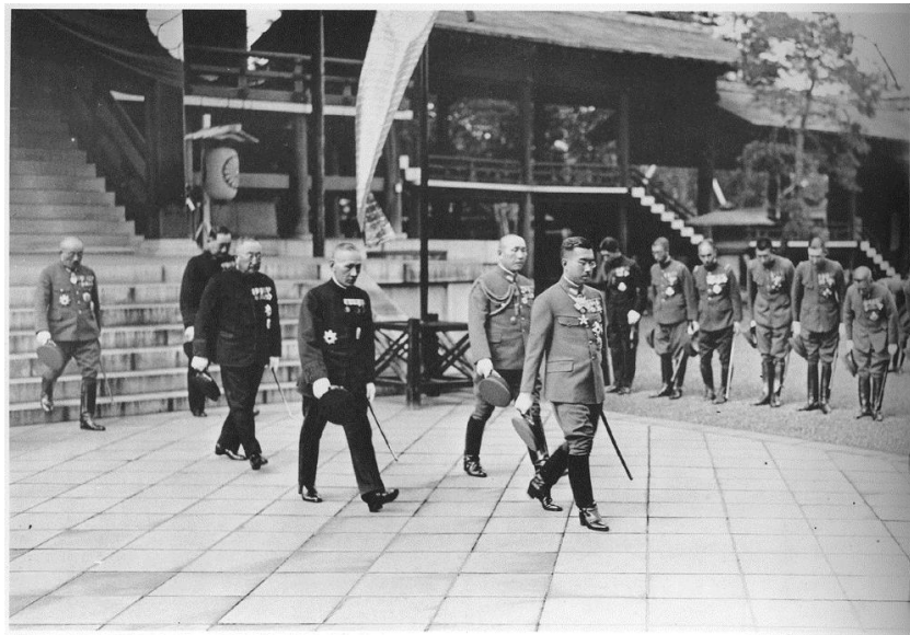
Hirohito at Yasukuni Shrine in 1935