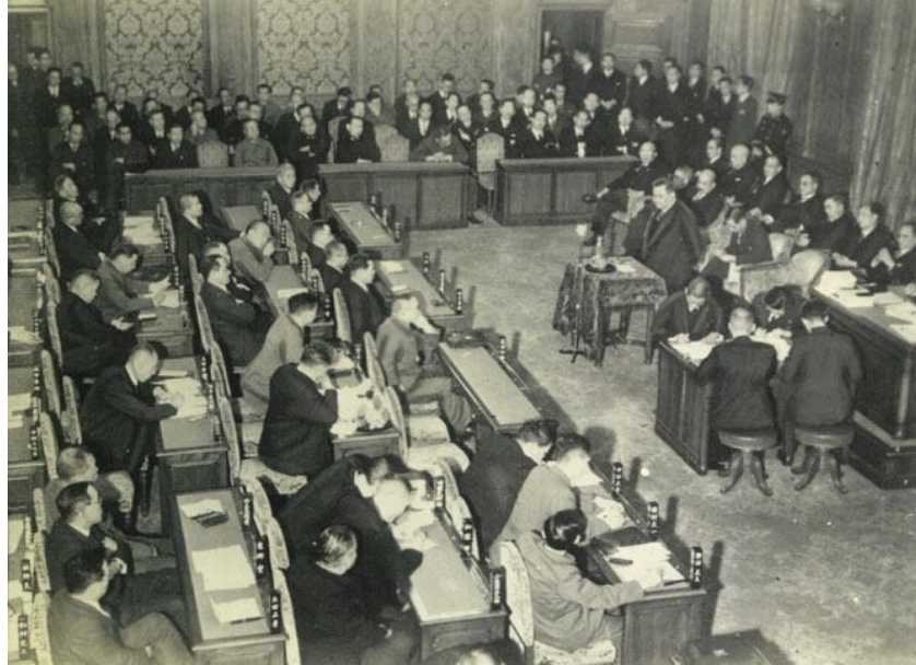
Finance Minister Kaya Okinori addresses Diet Budget Committee, 1944