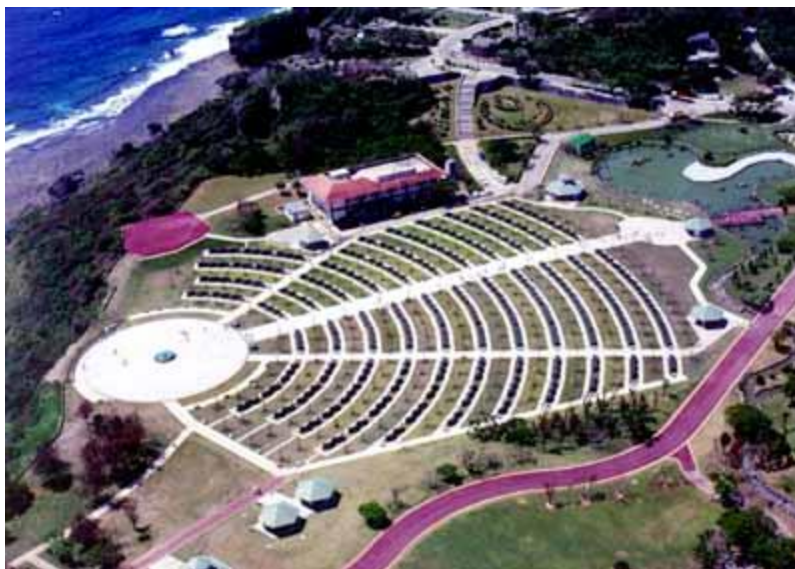
Cornerstone of Peace. More than 237,000 names of deceased civilians and soldiers are inscribed.

Yet for all its universalism, we note the continued stamp of the nation state in two important ways in the memorial spaces at Mabuni. First, the dead are arrayed in separate areas by nationality, and with Okinawans distinguished from mainland Japanese. Second, Mabuni Hill includes not only the Okinawan representations encapsulated in the Cornerstone of Peace and Konpaku-no-to, but the NOWC and the prefectural military memorials with their intimate ties to the Japanese military and Yasukuni Shrine. The mélange of memorials illustrates the conflicting approaches to commemoration between the Japanese state and Okinawan prefectural authorities. We may say that NOWC is a monument to war while the Cornerstone is a monument to peace. The Cornerstone of Peace is notable for its inclusiveness in commemorating the dead of all nations, its honoring of civilians and military victims of the Battle, and its partially successful attempt to transcend nationalist categories in search of universal peace. It is an achievement that has been realized in no mainland Japanese, American, British or German national commemorative site with which I am familiar. 12