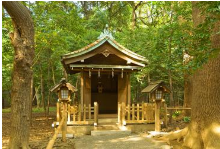
Chinrei-sha, Spirit-pacifying shrine

that is, all who died in uniform from Meiji through the Pacific War (2.1 million in the Pacific War), Yasukuni reinforced its position as the central symbol linking emperor, war, the military and empire. John Breen's sensitive analysis of the shrine's rites of apotheosis and propitiation well documents the nexus of power and ideology that gives the shrine its special place in contemporary Japan. 5