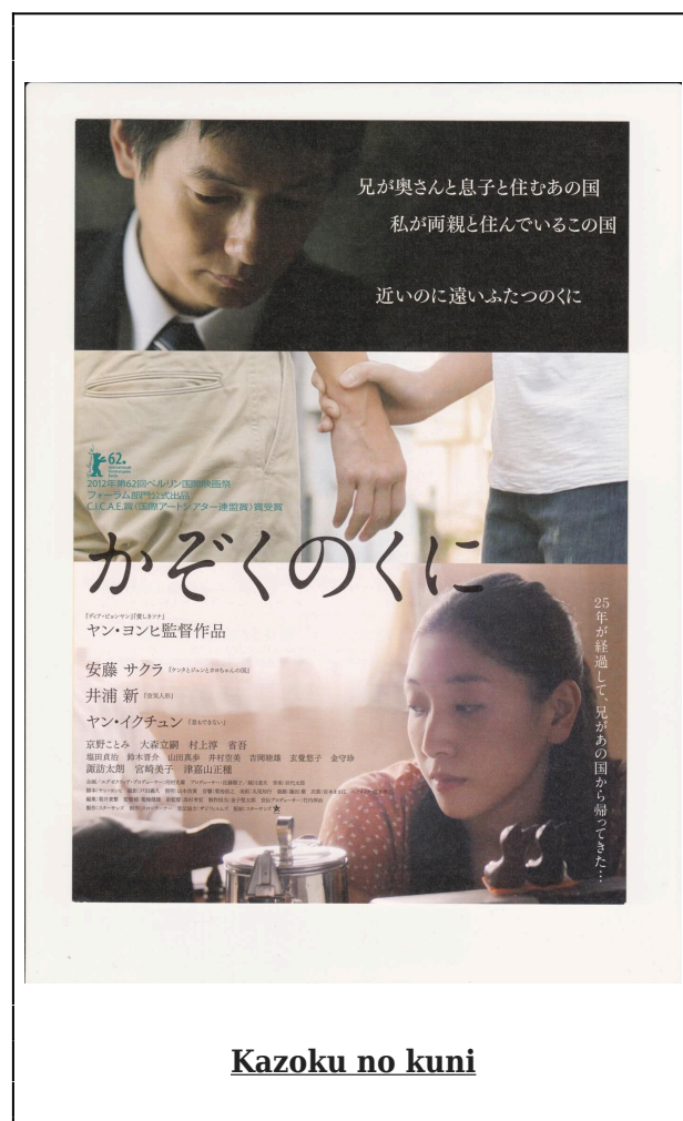
Kazoku no kuni

first-generation Zainichi in Osaka, and her brothers’ decision to emigrate to North Korea, and about Yang’s niece, a young daughter of one of the brothers who had emigrated to North Korea. Both accounts attempt to depict the full dimension of Zainichi and Zainichi-turned-North Korean lives, replete with humor and warmth often lacking in other accounts. Above all, without being blind to the larger context of Zainichi lives, the documentaries depict them as multidimensional human beings.