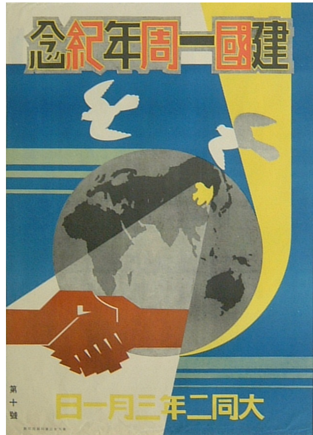
The "concord of nationalities"

The second legitimacy claim made by the puppet regime was that it represented the “concord of nationalities” ( minzoku kyowa ) a conceit that was supposed to represent two advances over older colonial ideas. Not only was the concord supposed to reject exploitation and the reproduction of difference between ruler and ruled, but it was also designed to counter the homogenization of differences that nationalism had produced and that had led to nearly insoluble conflicts. By allegedly granting different peoples or nationalities their rights and self-respect under a state structure, Manchukuo presented itself as a nation-state in the mode of the Soviet “union of nationalities”. Among others, Tominaga Tadashi, the author of Manshu no minzoku (Nationalities of Manchuria), wrote copiously about the early Soviet policy towards national self-determination. It was a policy that fulfilled the goals of federalism and protected minority rights, while at the same time it strengthened Soviet state and military power particularly with regards to separatism in the old Tsarist empire. Thus, nationalism ought not to be suppressed, but rather utilized positively for the goals of the state.(34)