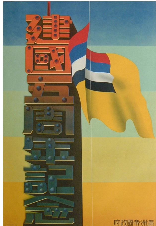
Manchukuo's industrial production