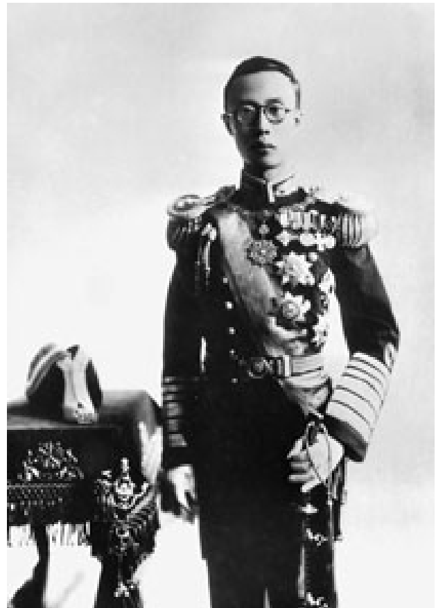
Pu Yi as emperor of Manchukuo

hierarchical “family state” ideology with pan-Asianism.