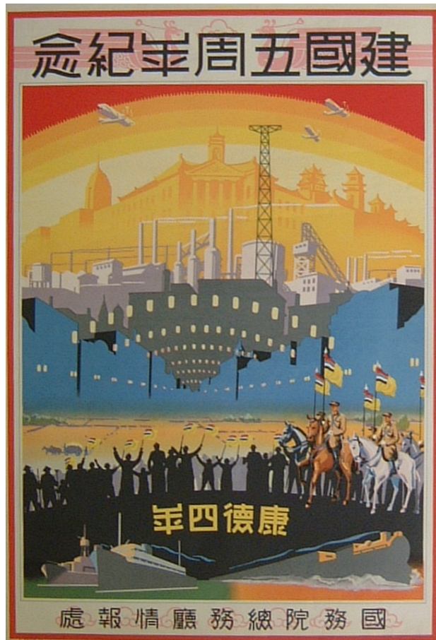
Manchukuo's future, 1937

The other side of this developmental state was the brutality of an occupying army. The massacres of the resistance, the notorious human experiments with bacteriological toxins developed by Unit 731 in Harbin, the dispossession of agricultural land from Chinese farmers, and other brutal crimes have been well recorded. Manchukuo presents us, on the one hand, with a record of cruel violence; and, on the other hand, with the record of a developmental state.