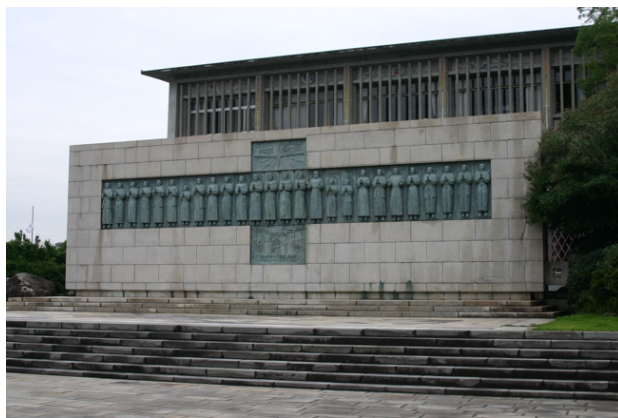
Front of the twenty-six martyrs museum, Nagasaki

In 1590, at age 60, Frois was sent to Macao, accompanying Visitor General Valignano. Three years later he returned to Nagasaki; and two years after that, in 1597, the persecution of Christians began in earnest in Japan. Frois' last report was on the fate of the twenty-six martyrs crucified in Nagasaki.