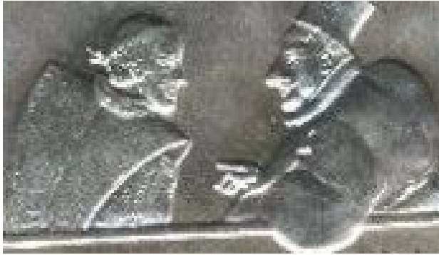
Oda Nobunaga and Frois