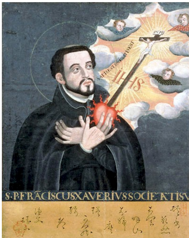
Japanese portrait of Francis Xavier

In 1581, in the capacity of interpreter, he accompanied Visitor General Alessandro Valignano on the latter's travels in Japan, and was welcomed in Kyoto and Azuchi by Nobunaga. Nobunaga died the following year.