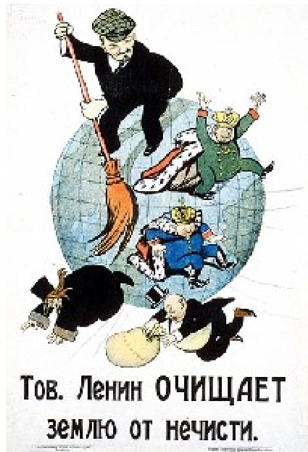
Depiction of Lenin sweeping the globe

The third initiative was the Baku conference of 1920, which marked the turn by the Communist inheritors of European socialism to the anticolonial movements in Asia and Africa, generating the powerful alliance of Communism and anticolonialism that was to shape the global decolonization struggles of the twentieth century. [5]