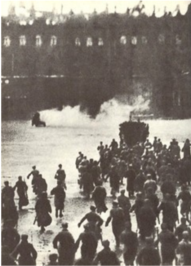
Image from the Bolshevik Revolution, 1917