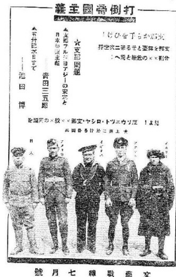
Photo collage from Bungei sensen showing five imperialist nations vying for control of China: Japan, American, England, France and Italy. Headlines read, "Get your hands off China!" and "The stage will be set for WWII in China." The Chinese header reads "Down With Imperialism." (July

study groups, publications, theater guilds and arts movements throughout the world, including Japan, Germany, Hungary, Poland, Austria, Korea, China and the United States. [6] Denning writes, "The 'imaginative proximity of social revolution' electrified a generation of young writers who came together in a variety of revolutionary and proletarian writers' groups." [7]