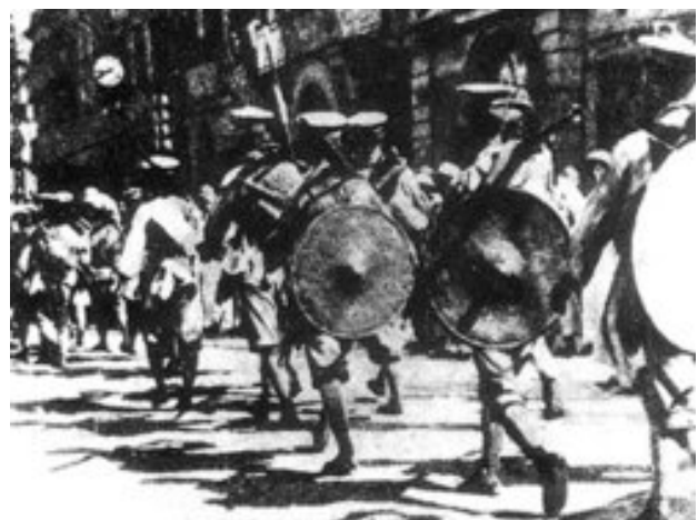
National Revolutionary Army forces enter the British Concession, Hubei, 1927.