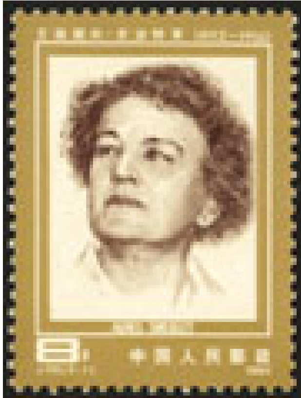
Agnes Smedley (Chinese postage stamp)

Last, but not least, Shanghai embodied the conflicts and contradictions of capitalist development. The considerable flow of people, ideas, goods and capital throughout East Asia and the world was enabled by the capitalist-imperialist development of cosmopolitan, urban centers like Shanghai, Tokyo, and Dalian (Dairen). Shu-mei Shih writes: Shanghai “was a semicolonial city integrated with global economy and politics though the efforts of an economy-driven Euro-American imperialism and a territorially and economically ambitious Japanese imperialism; it was a city of sin, pleasure, and carnality, awash with the phantasmagoria of urban consumption and commodification.” [16] According to Raymond Williams, the development of European modernism “had much to do with imperialism: with the magnetic concentration of wealth and