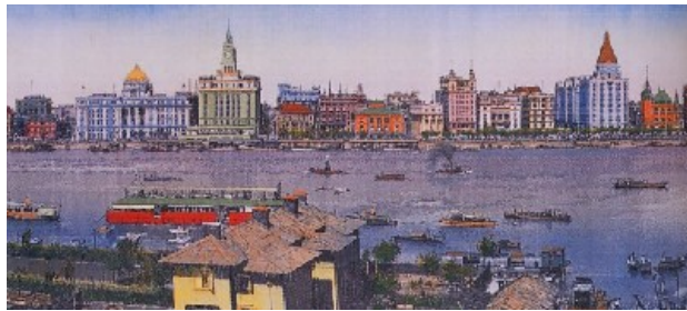
The Bund in Shanghai in the 1920s

and they received significant financial support from those visits. [8] Shanghai was the gateway for Japanese radicals seeking to study in Russia. [9] Shanghai was the site of the formation of the Chinese Communist Party in 1921. It was a burgeoning industrial city of immigrants rife with labor and national problems. S. A. Smith writes, "In this city of 2,700,000 people, there were up to 800,000 working people, including 250,000 factory workers... By March 1927 it [the Communist-led Shanghai General Labour Union] claimed that 502 labour unions, with 821,280 members, were affiliated to it." [10]