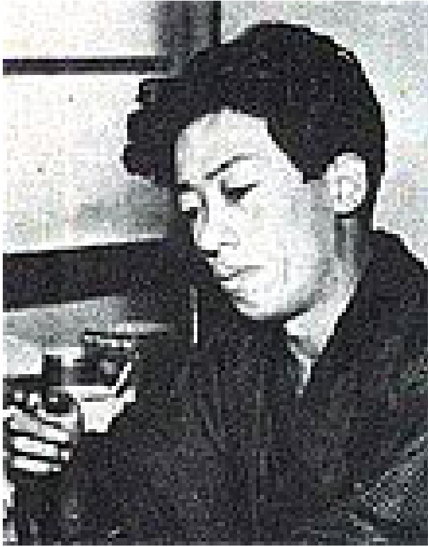
Kobayashi Takiji, subject of symposia in Tokyo and China

The turning point [for the development of proletarian arts] was the world upheaval of 1917-1921. In the wake of the European slaughter, regimes and empires were challenged: there were revolutions in Czarist Russia and Mexico, brief lived socialist republics in Germany, Hungary and Persia, uprisings against colonialism in Ireland, India, and China, and massive strike waves and factory occupations in Japan, Italy, Spain, Chile, Brazil and the United States. [4]