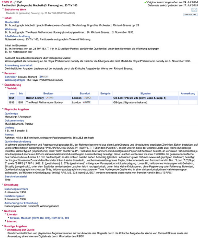
Fig. 6 Source q13348, the first page of Macbeth in Strauss's handwriting given to the Royal Philharmonic Society

are slight differences in the measurements of the page in the two places), and it is somewhat differently organized. 19 Among the details provided are the item's date of creation, current location (at the British Library, including the call number), an exhaustive description of the document's physical appearance, and a list of places where it has been discussed in the literature (in the present case, the website only lists the relevant volume of the Critical Edition). Although there is no formal listing of literature in the Critical Edition, there are two footnotes to relevant English-language materials unmentioned on the website. 20