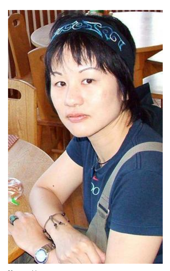
Young Ainu woman

Prejudice against and misunderstandings of the Ainu continue to exist in contemporary Japan. [10] The comment of one student here that the Ainu seem to be an "old", i.e., noncontemporary ethnic group may be seen in such a context. However, the fact that a quarter of respondents in the first survey saw their own ethnicity as "Ainu" suggests that other, more complex views of the Ainu also exist among young Japanese. While we accept that this identification with the Ainu is unlikely to exist outside Hokkaido, and in this case was probably influenced by the context of the course in anthropology, nevertheless we submit that our results imply that straightforward anti-Ainu prejudice no longer exists amongst a significant group of young Japanese adults. Even in Hokkaido, it is probable that Japanese students normally rarely think about the Ainu in terms of their own identities. In this case we accept that they were almost certainly encouraged to think in such terms by the context of the lectures. However, the important point is that, when give the opportunity to think about the Ainu, so many students were willing to accept a degree of Ainu ancestry for themselves. Such a view is, of course, quite consistent with what anthropologists now understand about the population history of the Japanese Islands, including the mixture of Ainu with other elements to form the Japanese people.