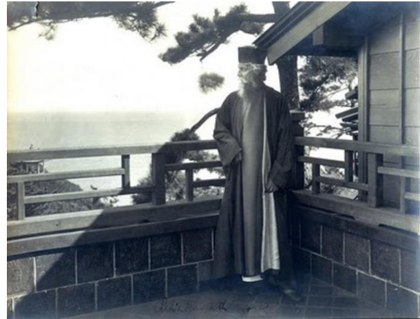
Rabindranath Tagore in Japan, 1916

However, relations between Japan and the leaders of independence movements in Southeast Asia remain a controversial subject in Asian historiography. The position of those Southeast Asians who supported the Japanese war effort was much more ambivalent than is generally believed. The Indonesian independence activist Mohammed Hatta (1902–1980) is a case in point. Hatta is known for his collaboration with the Japanese occupation authorities during the war, but even at that time he was no Japanese puppet. And even before the war, in the 1930s, he was capable of a sober critique of the problems inherent in the Japanese version of Pan-Asianism. This is made