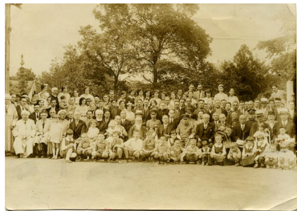
Pan-Asian gathering in Tokyo in the late 1930s (participants include Tōyama Mitsuru, a central figure in the Japanese nationalist movement, General Hayashi Senjūrō and Tatar pan-Islamist Abdurreşid Ibrahim)

Many prominent Asians, however—politicians, diplomats, intellectuals, and writers alike—were forced to choose sides, particularly after the outbreak of the “Greater East Asian War.” China,