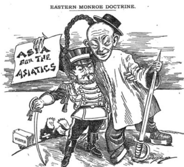
The Asian Monroe Doctrine

The assertion of racial and cultural commonalities presented here went hand in hand with the legitimization of Japanese superiority on the grounds that Japan was a country chosen by the gods. As early as the late 1910s, a number of writers, such as Kanokogi Kazunobu, Kita Ikki, and Ōkawa Shūmei, spoke of a divine Japanese “mission” to liberate Asia. This high-sounding objective was often difficult to distinguish from the substitution of one form of colonial oppression (by Europeans) for another (by fellow Asian Japanese). And a belief in Japan’s divine mission was by no means limited to radical reformists. Even mainstream writers who eschewed ideologically driven rhetoric and sought to explain international relations in terms of Realpolitik, such as Tokutomi Sohō (1863-1957), urged Japan to establish an “Asian Monroe Doctrine.” In doing so, Tokutomi may have been applying an idea of Western provenance to international relations in East Asia, but he still believed, like Kita and Kanokogi, that Japan had a special “mission” to accomplish in East Asia.