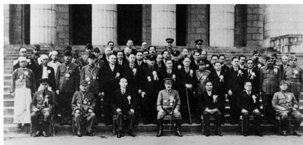
The Assembly of the Greater East Asiatic Nations, 1943, with Japanese Prime Minister General Tōjō Hideki in the center and representatives from China, Manchukuo, Thailand, India, the Philippines and Burma.

So, even though schemes for pan-Asian unity became more and more unrealistic as the fortunes of war turned against Japan, the official espousal of Pan-Asianism by the Japanese government and military resulted in a further wave of publications on Asian solidarity and brotherhood.