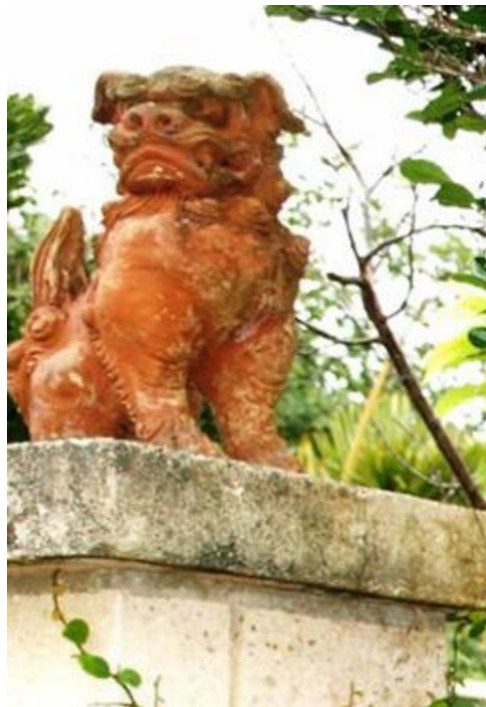
A Lion-dog statue, or 'Shee sah'

The Yomitan struggle to reclaim land from US military bases and to preserve its pre-war aza structure, Hara Tomoaki explains,[48] closely reflects contemporary village governance. Specifically, the third aspect of Yomitan's community development, positive re-evaluation of traditional local knowledge, is manifested in the authoritative position given to geomancy, commonly known as fengshui ( huu-sui in Japanese or hun-shi in Ryukyuan). A simplified definition of Fengshui is 'an ancient science that has its roots in the Chinese way of viewing the Universe, where all things on Earth...take on implications of positive or negative energy ( chi )'.[49] It is known to have been introduced to the Ryukyu kingdom from southern China 400-500 years ago, and has become embodied in Ryukyuan major architecture (e.g. Shuri Castle) and urban planning. Today, the influence of fengshui is seen in people's housing features such as the placement of lion-dog decorations throughout Okinawa and the location and shapes of tombstones.[50] Fengshui is alive in the private realm of daily life in Yomitan and elsewhere in Okinawa, but rarely appears in the public context of community development. This is because local-specific knowledge is usually devalued in favour of standardised, top-down professional guidelines.[51]