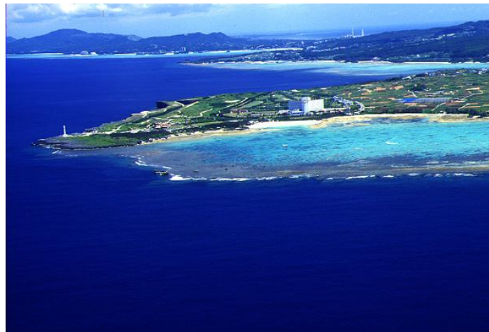
Yomitan village and the sea

The population of Yomitan is over 35,000, divided into 23 districts called aza . Each aza has no more than a few thousand resident members: it is a close-knit self-governing unit of villagers' day-to-day affairs, such as education, health, production, recreation and cultural events. Most aza existed before WWII, surviving the Battle of Okinawa, and some date back to the administrative zoning set up when ruled by the Ryukyu Kingdom (1429-1879). On any random visit to an aza , one is likely to encounter festivals that promote the local: pottery, music, dance, food etc. On the other hand, communal support comes with responsibilities. Contributions to community events such as funerals and other annual rituals also take up considerable time, making demands on personal life. Thus Yomitan Village is composed of geographically close members who know each other well, at least since their grandparents' generation.