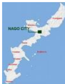
Nago City map

The special financial zone designation, the only one of its kind in Japan, includes a 35% reduction of corporate taxes, low-rent office space, an 80% subsidy for communication expenses, and a 30% subsidy for hiring young workers. Given that wages in Okinawa tend to be about 40% lower than the mainland, the 30% subsidy means that firms relocating to the Nago City financial center can achieve a 70% reduction in labor costs.[24]