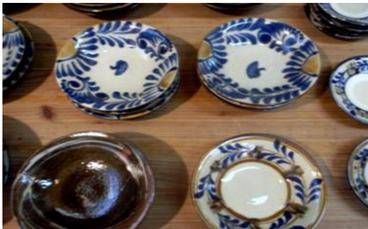
Kiln (above) and products (below) sold at the Yomitan Home of Pottery