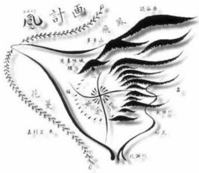
Fengshui Map of Yomitan