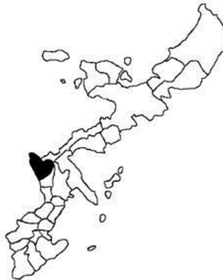
Yomitan Village in Okinawa Main Island

A visitor to Okinawa normally passes first through Naha, the capital, a dense, noisy and commercialised city full of cars, trucks, shops and concrete houses right next to winding narrow paved roads. A one-hour drive north along the main road, sandwiched on both sides by long fences and the barbed wire of US bases, brings one to Yomitan Village on the west coast of central Okinawa (see map below). Inside the village, the roads are winding and narrow with concrete houses built close to each other, as in Naha, and the US military presence is prominent, evidenced by the tall, white shrine and US and Japanese flag poles at the military gate of Torii (literally “Shrine”) Station. Yet something here is different from elsewhere in Okinawa. There is a calmer, old-fashioned and dignified feel to the place. There are more earth colours, green farmlands and sugar cane fields, and more natural (unconcreted) beaches. More buildings have antique features such as traditional Okinawan-style red tile roofs, and stone walls and pavements. In Okinawa Main Island, Yomitan is a particularly attractive place for visitors. What makes it special? What are the implications for other communities living with US military bases?