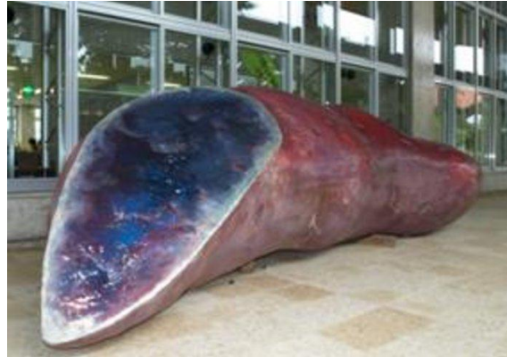
A replica of the ‘beni-imo (red sweet potato)’.

Company purchases the products of local beni-imo farmers at appropriate prices. The Company and Chamber of Commerce further promote mass processing of beni-imo products that require peeling and pasting, creating further local employment.[9] Beni-imo became a Yomitan brand, used in pies, ice cream, biscuits, bread etc. The Company markets these products widely: they are sold in shops along main tourist streets of Naha, at airports, and in specialty shops in mainland Japan. The beni-imo has been turned into a unique local industry and an economic stimulus by the villagers themselves.[10]