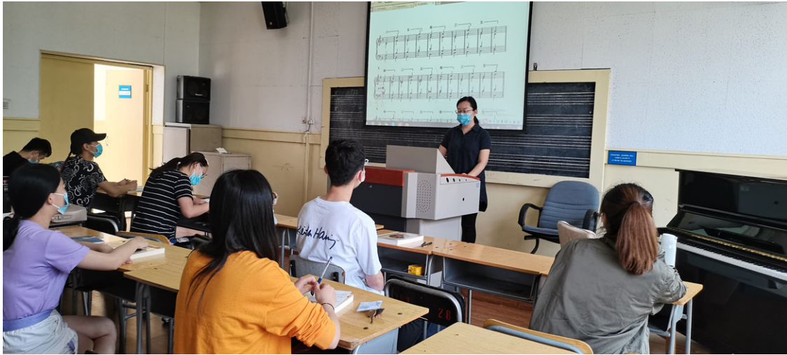
Figure 1 The situation of teacher and students wearing facemasks in class in a university in China.