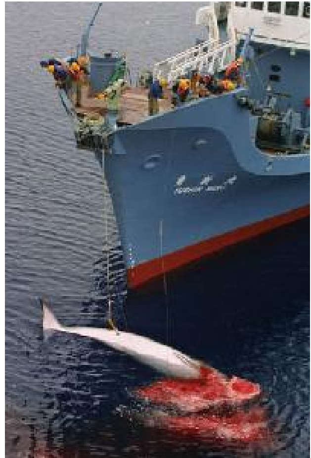
Japanese whaler in the Antarctic

What especially angers environmentalists is the fact the Japanese hunt is taking place in the Southern Ocean Whaling Sanctuary, an area encompassing 21 million sq miles of sea around Antarctica which the IWC declared off-limits for whaling in 1994. Japan ignores it.