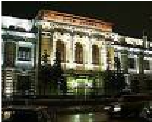
A private Russian bank received the North Korean funds

pointed out that “The American side promised to resolve the financial question, and this promise was not fulfilled”. [12] Russia can play a significant role in the upgrading of the North Korea railway network, something which could assume major importance if the rejoining of Northern and Southern railways is really taken beyond the technical stage. [13] There have been rumours of a resolution of North Korea’s reportedly $8 billion debt to Russia inherited from the Soviet Union and a rail upgrading could resuscitate trade between the two. [14] Nevertheless, for reasons of geography as well as power, Russia carries less weight in the talks than the other countries.