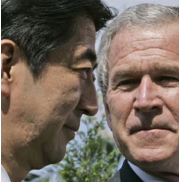
Bush and Abe in Washington