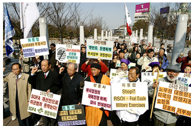
Anti-war, anti-military exercise protest in Seoul on March 12, 2003

It is likely that the joint US-ROK military exercise Ulji Focus Lens scheduled for 20-31 August will be put on hold. The South Korean and US military hold two joint exercises, involving amphibious landings, each year. Apart from the fun of it (boys with toys), and the usefulness of practice manoeuvres, these seem to have two functions. One is to persuade the South Korean public that there is really a threat from the north, and the other is to put pressure on the northern military. They have high symbolic value and incur regular protests from North Korea and from progressive groups in South Korea.[61] The government in Pyongyang has traditionally regarded Seoul as an appendage of Washington, much to the chagrin of South Korea, so if the exercises go ahead Roh Moo-hyun's credibility as a president of the Republic of Korea, independent of America and in command of his own military, would be seriously compromised.[62]