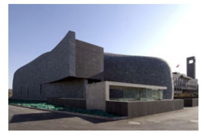
Isozaki's curvy new design for the Museum of Contemporary Art at the Central Academy of Fine Arts in Beijing, due for completion in October, seen inside and from the outside.