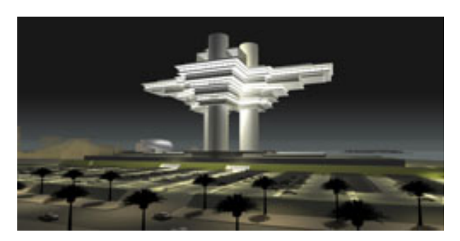
One of Isozaki's current projects, the Qatar National Library, draws on a plan he had for a "city in the sky" in the 1960s. Courtesy Arata Isozaki & Associates.