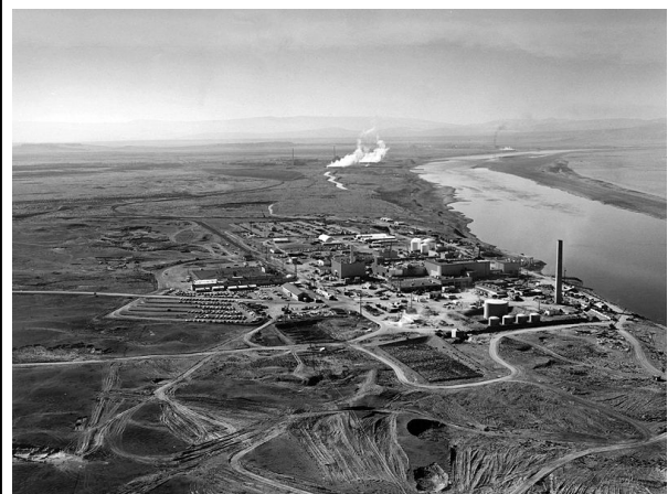
Hanford reactors along the Columbia River, 1960

A reactor for producing plutonium was established at Hanford in the northwestern United States. The greatest waste product generated by this reactor was an enormous quantity of heat. Hanford discharged this heat into the Columbia River, and it was Admiral Hyman Rickover, the “Father of the Nuclear Navy,” and the Electric Boat Company who first realized that this heat could be used as a source of engine propulsion power for submarines.