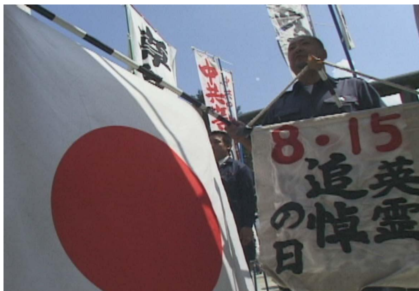
Former soldiers at Yasukuni on August 15, the anniversary of Japan's surrender in 1945.

The attempt to bury Li's film follows a string of similar incidents. In February, Tokyo's Grand Prince Hotel New Takanawa cancelled a conference by the Japan Teacher's Union – a popular ultra-right target -- after learning that 100 right-wing sound trucks turned up to last year's conference venue. The hotel's decision has been bitterly attacked by union officials.