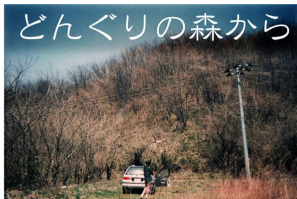
"From an Acorn Forest: Life before March 11"

In the course of my antinuclear activism, I found myself often beset by despair and powerlessness over nuclear proliferation. It was at such a moment when I turned my gaze toward my own way of life. The electricity that we turn on so casually: when I realized that its generation entailed various forms of discrimination and the sacrifice of many lives, I thought I wanted to do as much as possible to put myself at the polar opposite of such a structure. I began to clear part of a mountainside and to embark on a life of self-sufficiency as much as possible. 34