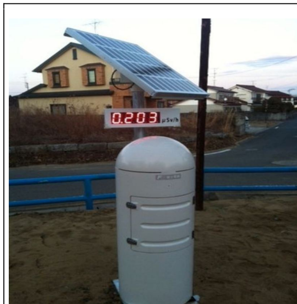
Radiation Monitoring Post (Minami-Soma, Fukushima)

• Strange monitoring posts dot the landscape of towns and villages. They indicate the levels of atmospheric radiation from moment to moment.