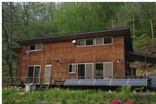
Café Kirara, with solar panels

of precious lives required by the promoters of consumption. (Muto 2012: 51-52) The way she prepared for her new life “in the acorn forest” reflects this resolution. When she was 42, she began by carving out a hillside, digging out tree roots, moving soil, creating a level space, and building a hut. (See slides 20-29 here )