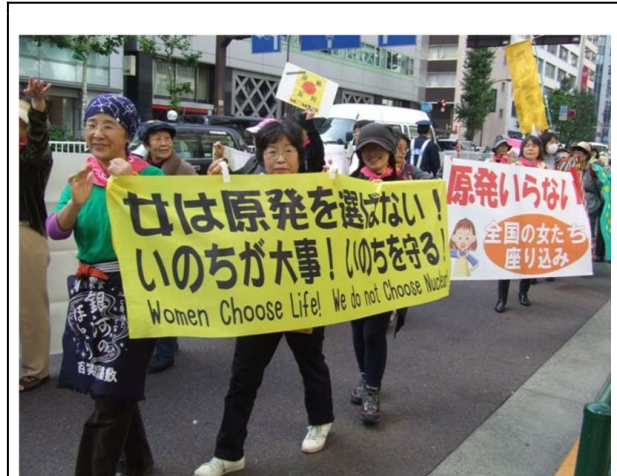
Women in front of METI, holding the banner, “Women Choose Life! We do not Choose Nuclear Power”

nonviolence, will create a new world! Let’s sit, talk, and sing together!