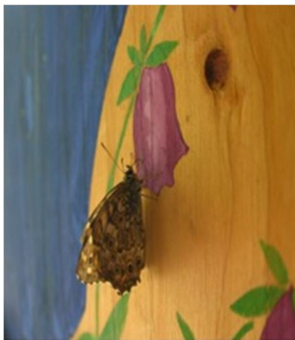
A butterfly alights on a flower painted on the Kirara doorway