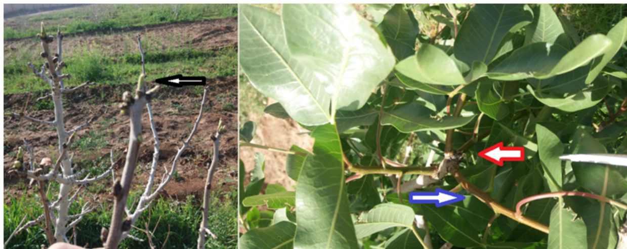
Figure 1. Comparison of control (left) with terminal bud growing (black line) and 'Apatiye' cultivar (right) with abort terminal bud; dead terminal bud (red line) and shoots grown from lateral buds (blue line).

number of shoots and their length determine the yield of the trees. Pistachio trees have few lateral shoots because of the low number of vegetative lateral buds and strong apical dominance. Removal of terminal buds can reduce apical dominance and stimulate lateral bud formation. In this study, 'Apatiye' cultivar produced had more lateral shoot through the death of the terminal buds. This trait has already been reported in some fruit and forest trees (Costes et al. , 2015). In conclusion, it can be said that 'Apatiye' cultivar has a valuable potential for breeding pistachio cultivars with low alternate bearing and suitable for manual harvesting.