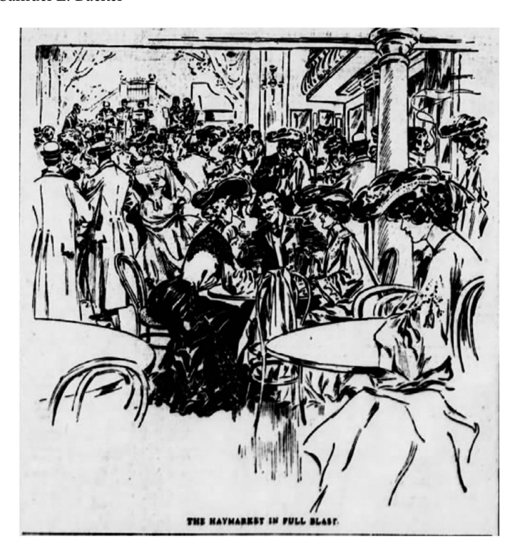
Figure 5. Depiction of the Haymarket in full swing. Sun (New York), March 29, 1903.

Black areas, where the authorities turned a blind eye—and an open hand. At the same time as the area's racialized identity helped ensure the survival of venues like the Haymarket, it also meant the proximity of a variety of other vital cultural institutions, from the "dive" saloons that fostered a generation of pianists to Marshall's Hotel, a gathering place for Black artists and intellectuals. As the association between crossclass entertainment, commercial sex, and Black culture grew stronger among white revelers, it would help to generate new types of cross-racial interaction crucial to the commercial success of groundbreaking musical forms like ragtime and, later, jazz. 115