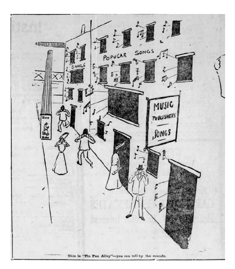
Figure 1. "Tin Pan Alley? Why It's The Place Where Popular Songs Come From," St. Louis Post-Dispatch, May 10, 1903.

Over time, Tin Pan Alley's relationship to these spaces—and the crowds that filled them—would define its cultural production. <sup>42</sup> It was not simply that publishers molded songs to fit public taste. Rather, the industry and the broader world of commercial leisure developed together. Popular music had long been divided between songs performed on the male-dominated stage and those intended for female-driven home consumption. <sup>43</sup> Tin Pan Alley's success in crossing this divide would help shape a new style of American entertainment. By exploring this business-influenced process of cultural evolution, it is possible to gain perspective, not merely on the emergence of American popular song, but into the broader set of social changes that revolutionized life in the United States at the turn of the twentieth century.