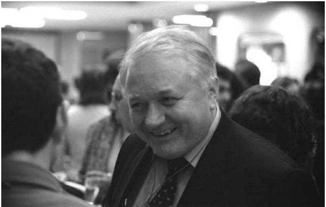
Rashid Sunyaev enjoys the discussion at the welcome party.