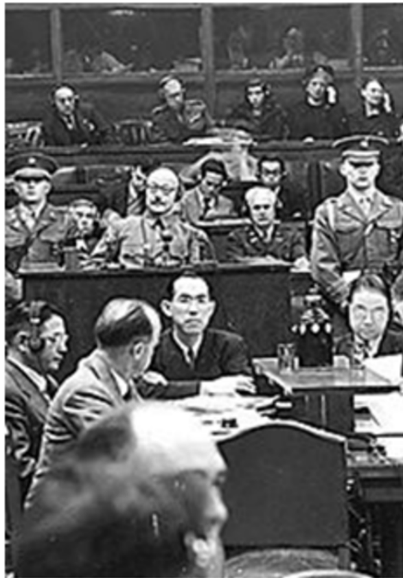
Tōjō center during Tokyo Trial

To what extent the Tokyo Trial actually shaped the Japanese sense of history is difficult to tell, as a sense of history is not as simple as to be shaped exclusively by one trial. Above all, the Tokyo Trial itself has not been visible enough in public discourse to be connected to the majority's view of history. Still, the neo-nationalist movements show one aspect of the Trial's long-term impact on the Japanese sense of history. Discourses surrounding the Tokyo Trial in the 1990s show that the Trial continues to be strongly related to how some see the character of the war, which is still emotionally debated. The characterisation of the war is not necessarily settled in contemporary Japan and newspapers still conduct opinion polls asking how to characterise the 'past war': aggression, self-defence, or a mix of both elements. 61 What is more, there is not yet an official term for the