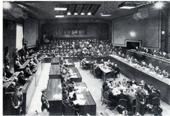
Tokyo Trial: Judges (left), Defendants (right) and Prosecutors (rear)

perceptions are examined through popular reactions to the Tokyo Trial itself, as well as related events and movements within society — including films, symposiums, historical controversies, the rise of neo-nationalism, the Yasukuni Shrine row — and public and media responses to them. 4