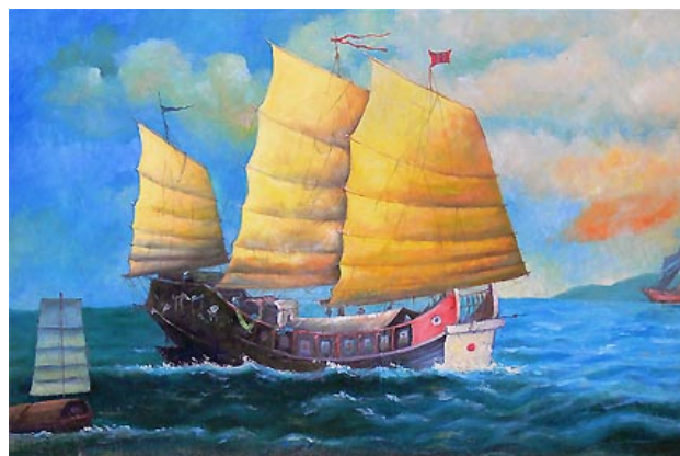
Chinese junk, 17 th century

agrarian economy as well as urban exchange.