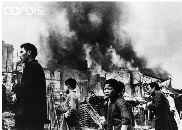
Refugees flee Japanese bombing of Chongqing, the Nationalist capital

concerning the Holy Land protected Arab civilians from bombing.[20] For Japan, neither racial similarity nor cultural bonds mitigated the onslaught against the Chinese population in a “war without mercy” which was certainly no less brutal than the U.S.-Japan war which John Dower memorialized with this phrase, a war fought across racial and cultural divides.[21] Indeed, the China war exacted the heaviest toll in lives of all colonial wars—10 to 30 million Chinese deaths being the best estimates available in the absence of official or authoritative statistics.