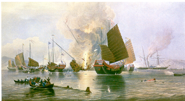
The First Opium War of 1840

The disintegration of the Qing in the early 19 th century set the stage for the onslaught of the Western imperialist powers in China and East Asia, bringing to an end the regional order and the protracted peace that had extended across East and Inner Asia to parts of Southeast and Central Asia.