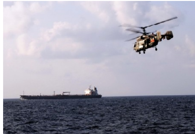
Helicopter escorts Chinese ship off Somalia, January 2009

the role of the US in East Asia and the Asia Pacific. David Shambaugh has noted the preponderance of the “US-led security architecture across Asia. This system includes five bilateral alliances in EA; non-allied security partnerships in SEA, SA and Oceania; a buildup of US forces in the Pacific; new US-India and US-Pakistan military relations; and the US military presence and defense arrangements in SW and CA.”[38] That formulation can be supplemented by recognizing the importance of the multiple US military bases throughout the region and beyond, the US militarization of space where again it has a virtual monopoly, the fact that as of 2006 65% of US sea-launched ballistic missiles were deployed in the Pacific maritime region, and the expansive conception of the US-Japan Security Treaty which has led Japan to extend its military reach to the Indian Ocean and to explore security arrangements with India and Australia which can only be directed against China.[39] In early 2009, moreover, both China and Japan have responded to Somali piracy with the dispatch of ships to patrol off the coast of Africa, and South Korea is considering similar actions, involving a major expansion of the military posture of each of these nations.