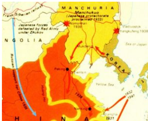
Battle of Nomonhan

Southeast Asia and the Pacific. At its height in the early 1940s, Japan's vast Asian empire and its pursuit of a pan-Asian order led to an extreme example of regional autarky, Japan's earlier strong economic and cultural ties to Europe and the Americas having been severed as a result of inter-imperialist rivalry. If Meiji Japan had placed its hopes for modernization and prosperity on economic, political and cultural ties with, and emulation of, the Western powers, Japan now found itself isolated from core regions of the world economy while fighting wars against powerful adversaries on multiple fronts.[17]