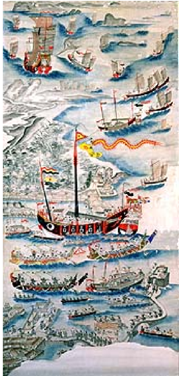
Ryukyuan tributary vessel