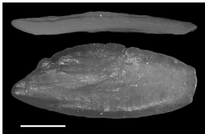
Figure 4. Right sagittal otolith of A. arigato (ASIZP-0082289). Top: ventral view; bottom: proximal view. Scale bar = 1 mm.

Dorsal-fin origin right behind the operculum; pectoral fin short; pelvic fin absent. First dorsal-fin base slightly shorter than second dorsal-fin base; with first dorsal-fin base 37.7% SL and second dorsal fin base 45.8% SL; prepectoral length 20.8% SL.