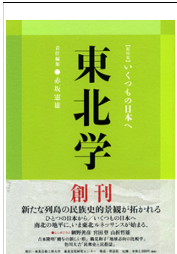
Fig. 4: The inaugural issue of

why were these facilities not constructed in the metropolises they served? The answer is simple: the Northeast is Japan's "nuclear power colony," replied Kawanishi. 20 Kawanishi is not the first scholar to notice that Tōhoku was being sacrificed for Tokyo, nor the only one to describe this sacrifice in comparison with that of Okinawa. 21 On the eve of America's 1972 return of Okinawa to Japan, historian Tōyama Hideki had already identified the former Ryūkyū kingdom as the sacrifice for Japan's "national polity," and after 3/11, critic Takahashi Tetsuya drew out the parallel between the Northeast and Okinawa explicitly in a book on the "system of sacrifice" that victimized both. 22 Okinawa was, and is, made to bear the brunt of the American military presence; Tōhoku was, and is, made to bear the brunt of the Japanese hunger for rice, electricity, and cheap labor. 23