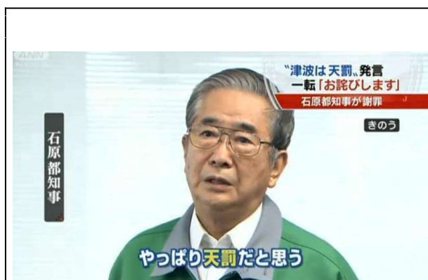
Fig. 2: Ishihara Shintarō retracting his remark that the 3/11 tsunami was "divine retribution"

known for his hardline nationalism and inflammatory comments, was, in this sense at least, always an odd fit for Tokyo. 2 He made this exceptionally clear when he attributed the March 11 earthquake to "divine retribution" against a country and a people that had lost their way, drowning in egoism and hedonism—a comment made only stranger by the fact that the governor of Tokyo seemed to be implying that Fukushima was a den of self-absorbed debauchery. This was not, Ishihara emphasized, Japan's true identity. Rather, it was imperative that Japan "use the tsunami to wash away egoism, to wash away the many years of crud built up on the hearts of the Japanese." Ishihara later (uncharacteristically) retracted this comment in the face of massive public outrage, but only long enough to turn it into an entire book published later the same year. 3 As governor of Japan's social, political, and economic capital, after 3/11 Ishihara continued to bemoan the social and moral disintegration wrought by postwar economic growth, arguing that this catastrophe was the long-awaited opportunity to escape from the postwar régime.