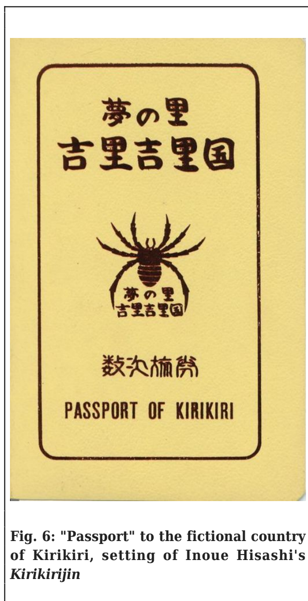
Fig. 6: "Passport" to the fictional country of Kirikiri, setting of Inoue Hisashi's Kirikirijin

However, if this were to come to pass it would lend an odd credence to Inoue Hisashi's 1981 novel, Kirikirijin .