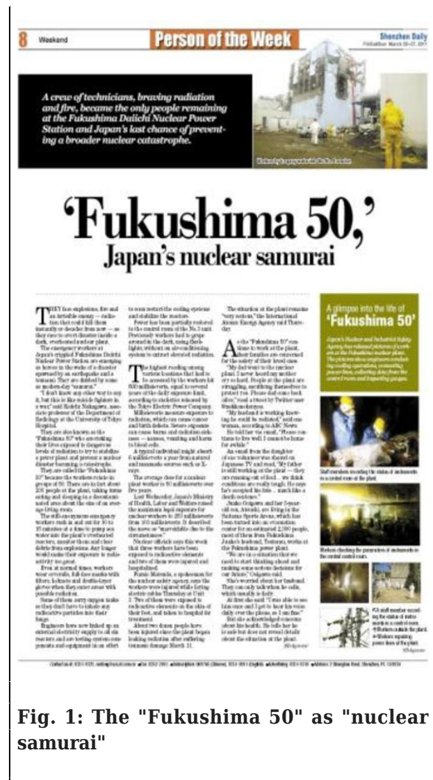
Fig. 1: The "Fukushima 50" as "nuclear samurai"

In the wake of the March 11, 2011 earthquake, tsunami, and nuclear disaster, much has been said about the character of Japan, and especially about Tōhoku and its people. In the early weeks and months, the exceptionally good behavior of an overwhelming majority of Japanese in the face of a disaster of almost unthinkable magnitude was the object of much admiration. Especially in the foreign press, mixed in with cringe-inducing references to the "Fukushima 50" as "nuclear samurai"-if anything, "kamikaze" would have been the more appropriate image-the tropes of "orderly" and "law-abiding" Japanese and "stoic" residents of Tōhoku were repeated frequently even by scholars whose careers are mostly built around combatting sloppy generalizations. Diverse voices from around the world, including those of Chinese netizens-more often cited as a bastion of virulent anti-Japanese sentiment-were joined in approbation. Sympathy and aid poured in from around the world, and the domestic media proudly relayed this news to their Japanese audiences.