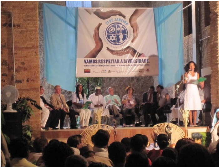
Figure 2. Event to commemorate National Day for Combat against Religious Intolerance organized by the municipal government of the city of Salvador in collaboration with the state of Bahia, January 21, 2010.

against Religious Intolerance ( Movimento contra Intolerância Religiosa ), which was created in Salvador in 2000 to call attention to Mãe Gilda's death, were foundational. The heart attack that had killed the woman, the movement argued, had been caused by "religious intolerance." By 2001, the expression "religious intolerance" had also been taken up as a rallying call against Evangelical Christian aggression by practitioner activists in Rio de Janeiro, who founded the Inter-Religious Dialogue against Religious Intolerance and for Peace Movement ( Movimento Diálogo Inter-Religioso contra a Intolerância Religiosa e pela Paz ). In subsequent years, the expression "religious intolerance" became the go-to term for describing attacks on African origin religions among practitioners.