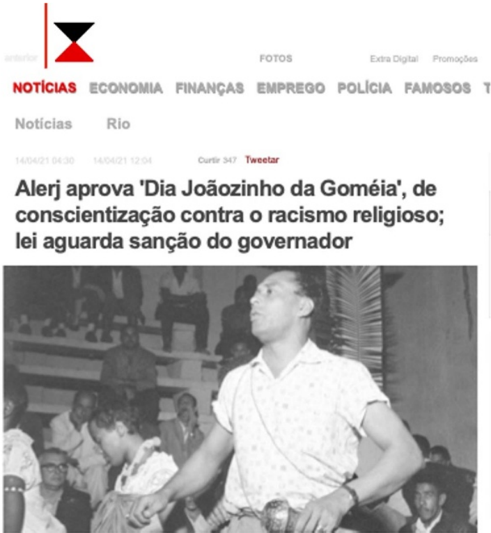
Figure 4. Screen capture of news article on the designation of state holiday for consciousness raising on religious racism by Legislative Assembly of State of Rio de Janeiro. Extra April 14, 2012, https://extra.globo.com/noticias/rio/alerj-aprova-dia-joaozinho-da-gomeia-de-conscientizacao-contr-racismo-religioso-lei-aguarda-sancao-do-governador-rv1-1-24969879 .

One example of the challenges that these efforts have confronted is a 2016 law proposal (PL 4,295) presented by Erika Kokay, who has served as a state representative for the Federal District in Brazil's National Congress since 2011. The law proposal sought to modify the text of the law that had established January 21 as the National Day of Combat Against Religious Intolerance in order to acknowledge the forms of religious intolerance that African origin religions experienced. 11 To this effect, it proposed the addition of the following articles: