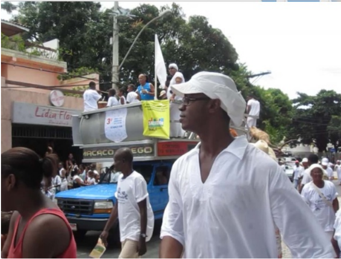
Figure 1. 3rd March Against Religious Intolerance and for Peace in Itapua, January 21, 2010.

events oriented to, while seemingly the same, differed from each other in substantive ways. Whereas the practitioner march deployed “religious intolerance” in reference to the preceding years’ Evangelical Christians attacks on African origin religious communities, the municipal government’s event construed “religious intolerance” as a potential threat to all religious communities that could be avoided through mutual respect for difference.