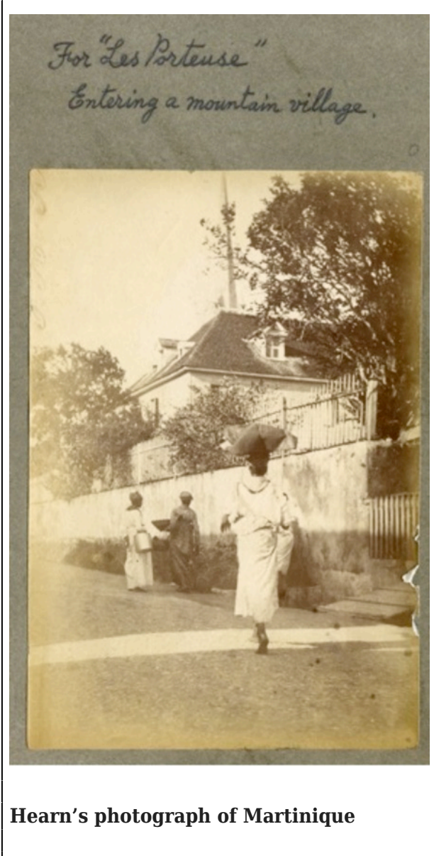
Hearn's photograph of Martinique

Had he lived another two or three decades, he would have been appalled at the manner in which the self-aggrandizing powerbrokers in the cultural establishment of Japan used him for the purposes of justifying incursions into Asia. He loathed the modern Japanese male and what he stood for, and in this he recognized the futility of his task, a futility keenly felt toward the end of his years, where he heard “nothing but soldiers and the noise of bugles.”