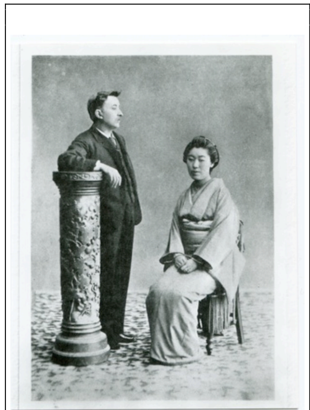
Hearn and his wife Setsu

Hearn may have been a story-reteller of great perspicacity, but his prose is rich in the florid clichés of the Victorian era and all too often bogged down by a stilted lyricism. It is fortunate for his reputation among the Japanese that this flowery language translates well into Japanese.