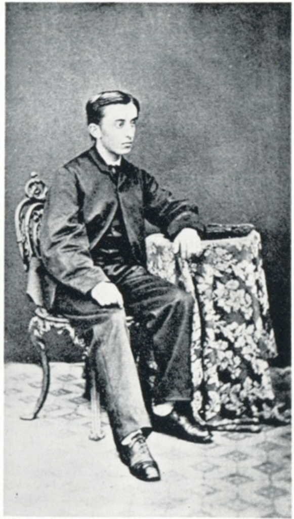
Hearn at 16

But it was with just such a family that Hearn found himself fettered late in his life. This Poe-faced outsider and aficionado of the eerie and the bizarre, who any number of times had been bereft of the barest means of subsistence, living off the smell of an oily rag in London, sleeping rough and wandering the streets of the Rue Morgue in Cincinnati and New Orleans, was to be earning a formidable salary as a teacher in Japan while supporting up to 11 people, including wife, four children, in-laws and servants. He published on average a book for every year he lived in Japan and was read eagerly not only by Americans for his esoteric insights into Japanese mores, traditions and passing lifestyle, but also by readers in China, India and Europe, though not Japan.