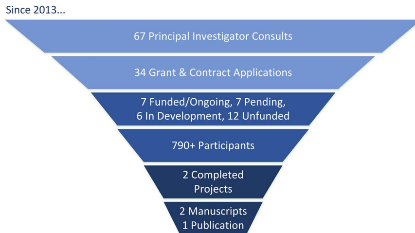
Fig. 2. Summary of the Northwest Participant and Clinical Interactions Network accomplishments.