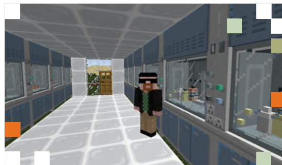
(Top) A flamethrower built in Polycraft World destroys some of the creatures bent on your destruction. (Bottom) Meeting a colleague in the corridor of a science building on the UT Dallas campus.

it, one of our thoughts was to implement synthesis on the molecular level where you could actually go in and build a molecule using elements," he says. "While this may not be the most scientifically relevant approach from a laboratory perspective, it would be scientifically relevant from an education perspective."