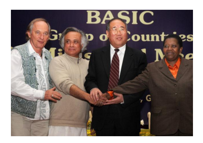
Representatives of the BASIC nations, Brazil, India, China and South Africa

The invoice was delivered by Brazil, South Africa, India, and China—the so-called "BASIC" nations--after their meeting in New Delhi on January 25.