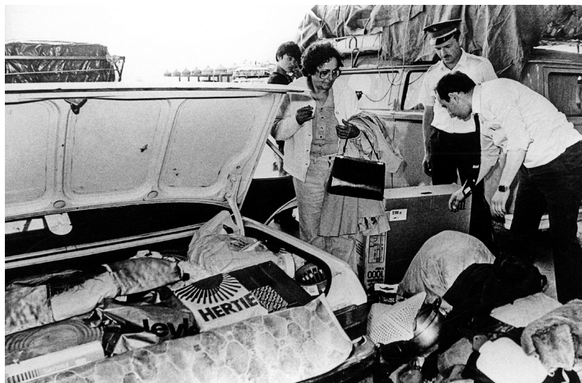
FIGURE 2.3 Border guards inspect guest workers' cars at the Bulgarian-Turkish border at Kapıkule, mid-1970s. The woman's trunk is stuffed full of consumer goods, including a bag from the West German department store Hertie.

extortion, and guest workers reported having to wait in hours-long lines of cars just to cross the border. 68 Murad rejoiced that his family was able to skip the lines because his uncle was the wealthy mayor of a local community. 69