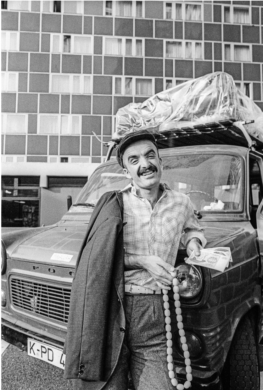
FIGURE 2.1 A quintessential portrayal of an Almanca , whom Turks in the home country denigrated as superfluous spenders, flaunting his Deutschmarks and posing proudly in front of his loaded-up car, 1984.