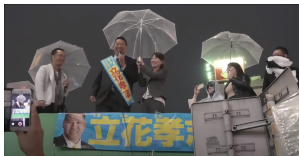
The view of the election car from the Seikei Yukkuri stream.

Because N-Koku streams are typically amateur, they commonly cut out, often at critical moments, and Ikebukuro was no exception. The chat section that appears on the side of each YouTube livestream was filled with cries of " kuru kuru " ('spinning'), a reference to the symbol that YouTube uses to indicate that a video or stream is buffering. The patchy reception that plagued the stream eventually gave way to a complete termination of its signal, and viewers came to be collectively stuck on a stopped frame that indicated buffering. Using YouTube's search function to find an alternative stream, I traveled to a channel I had never seen before, that of Hiratsuka Masayuki 19 , which was listed at the top of the search results.