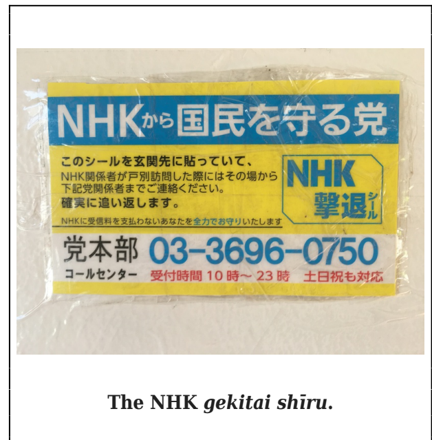
The NHK gekitai shiru .

whiteboard, he explained why his party promoted the "destruction" of Japan's national public broadcaster, NHK ( Nippon hōsō kyōkai ), and how he intended to protect the Japanese people from what he called the "viciousness" of NHK license fee collectors.