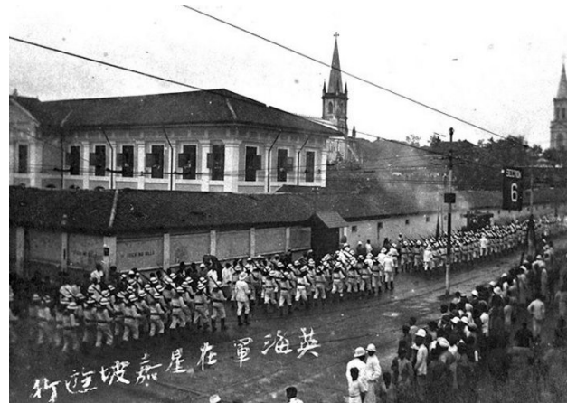
English troops marching in Singapore

Japan's occupation of Singapore and Malaya was obviously a wrenching experience for both victims and survivors.