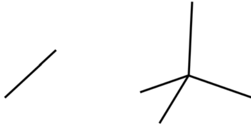
Figure 3. The class \text{sing}_{\mathcal{G}} \mathcal{M} consists of lines and spines of T -type sets.

The local approximation class \text{sing}_{\mathcal{G}}(\mathcal{G} \cup \mathcal{Y}) = \mathcal{G}(3, 1) consists of lines through the origin. The class \text{sing}_{\mathcal{G}} \mathcal{M} consists of lines through the origin and spines of T -type sets (see Figure 3). Meanwhile, the class \text{sing}_{\mathcal{G} \cup \mathcal{Y}} \mathcal{M} = \{\{0\}\} consists solely of a singleton at the origin.