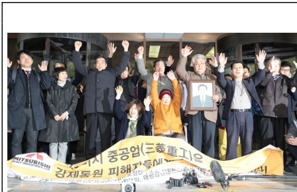
The South Korean Supreme Court upheld the verdict requiring Mitsubishi Heavy Industries to compensate Korean forced laborers

On November 30 th , 2018 The Japan Times waded into the interminable controversy over Japan's wartime misdeeds with a small editor's note tacked onto the end of a story about conscript labor. The previous day, South Korea's Supreme Court had ruled that Mitsubishi Heavy Industries should compensate Korean forced laborers. That followed a similar ruling against Nippon Steel in October. With another dozen lawsuits pending against about 70 Japanese companies, Japan's most venerable English-language newspaper appeared to question whether these laborers were actually forced to work at all.